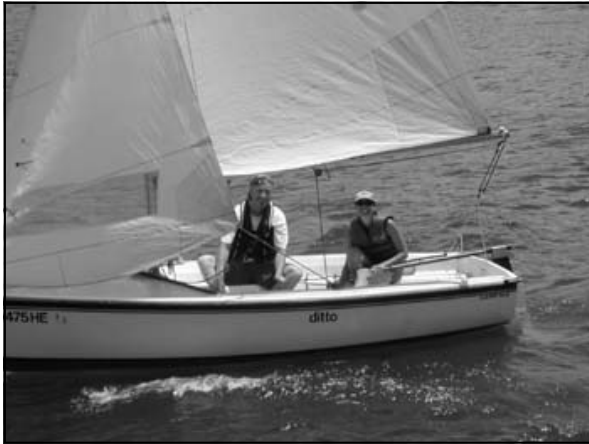
Adult Sail Training