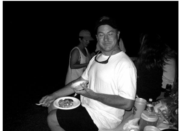
Everybody had their own way of having a good time at the Fleet Shrimp Social!

cob oozing with real butter! We had some fantastic homemade salads and desserts to compliment the meal, thanks to some very industrious fleet members!