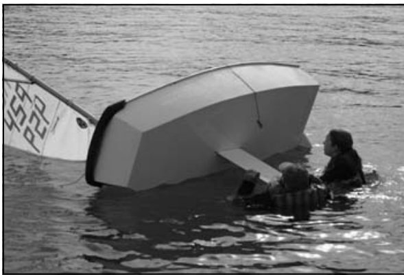
Junior Learn To Sail