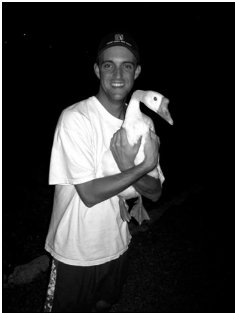
Hey goosie...want to go home with me?

club sailing day! So it was no surprise that we all had to pay the piper the following week with no wind and no races...and it looked like more of the same for week 3 as RC had to postpone for a little while but eventually enough wind (5-7) started to fill to get 2 races off. While the racing was a study in staying powered up in the motorboat chop, the fleet had some tight racing, especially in the second race when 5 boats rounded bow to stern at the first weather mark. Running on Empty , this time with Ryan and his "punk" crew, took 2 bullets....leaving Superman and Bon Temps , sailed by Jay Sacco, Phil Spletter and me (and at the helm no less!) to duke it out for second in both races, an early jibe on the last downwind leg of race 1 and a (I must say myself) perfect lee bow maneuver near the finish line in race 2 gave Bon Temps two second place finishes that day. I want to note that several boats were short handed so once again crew rides were available if you just showed up! I am not sure if there were any races pulled off for week 4 as it looked like no wind and RC was postponed on shore the last I knew. But I did hear that Running on Empty did not go out so if there were any races that day, the scores must be very tight now that they carry at least one DNC. If you didn't race in the last set of Summer Evening races, check the final scores on the AYC website.