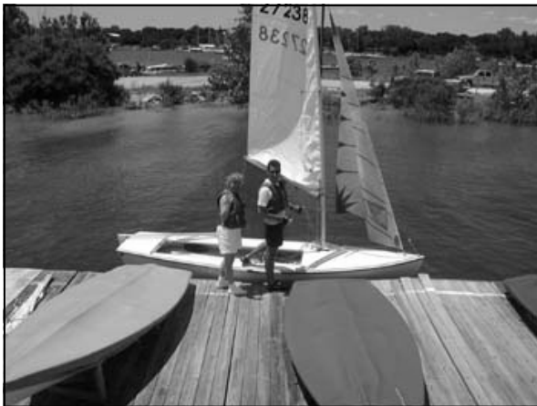
Adult Sail Training