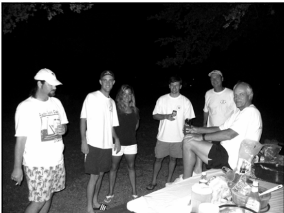
Some of the usual suspects taking a break before getting more shrimp

The J/24 fleet had a great turnout at our shrimp "boil & brew" party after the 1st series race of the Summer Evening Series on July 10th. A crowd of about 30 enjoyed endless supplies of boiled shrimp and grilled corn on the