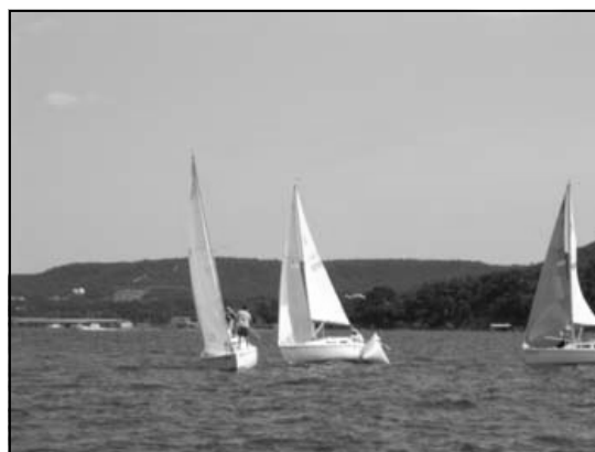
Rounding at Governor's Cup