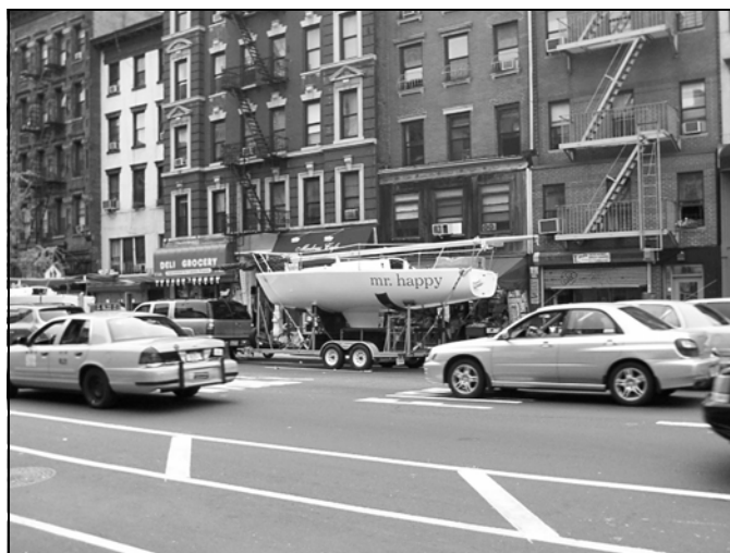
mr. happy in downtown Manhattan traffic heading home to big sky country from the J/24 Worlds