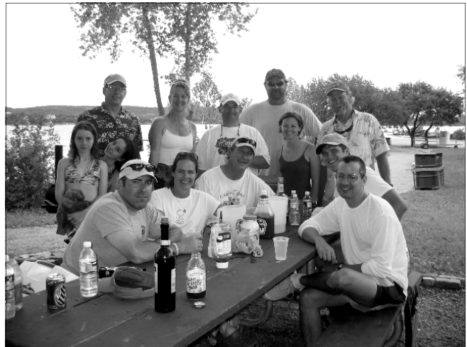
Remnants of the Ensign Fleet series opening cookout.

All in all, it was a rather short racing day, what with the East wind and a correspondingly short course. But that left us plenty of time for our first Ensign fleet cookout! It was a bring-whatever-you-feel-like-eating theme and it was great! Almost everyone stuck around to enjoy the mild (for May) spring afternoon, where we finally broke out a few bottles for the debut of 'Scotch Mist'. There was plenty of food, beverage and good cheer to go around, and while we may not yet be in the same league as the South Coast fleet with their permanent encampment, it was a really nice start. We hope to have at least one quasi-organized cookout for each of the remaining series, so keep a look out for those announcements in the future. Even for those Ensign fleet members who don't plan to race, we encourage you to come out and enjoy some food and friendship.