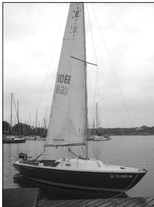
Getting ready for the blessing of the fleet on opening day.