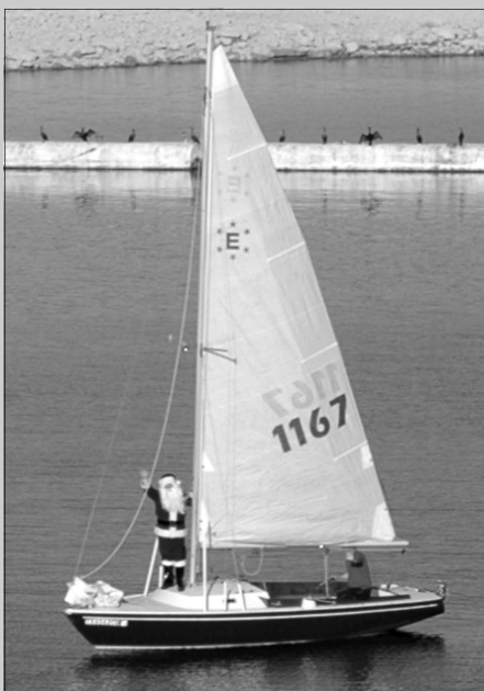
Santa Claus sails into AYC on December 10, 2005 for the Annual Children's Christmas Party, after the reindeer dropped him off at Stearns Island. "Animals aren't allowed at AYC...", so he "...couldn't bring the reindeer along", Santa said.