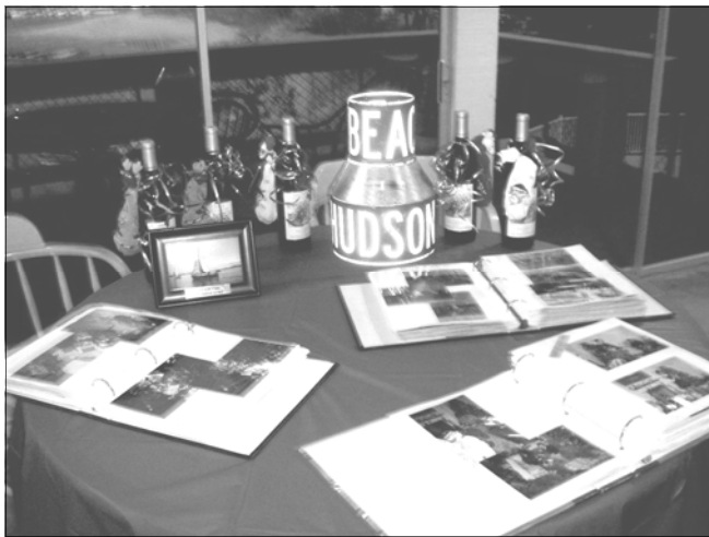
The J/24 Fleet's Perpetual Trophies, Photo Archives and Officer Gifts Looking Pretty!

as the club itself. And of course the Fleet scrapbooks provided some great laughs and remembrances from party's past!