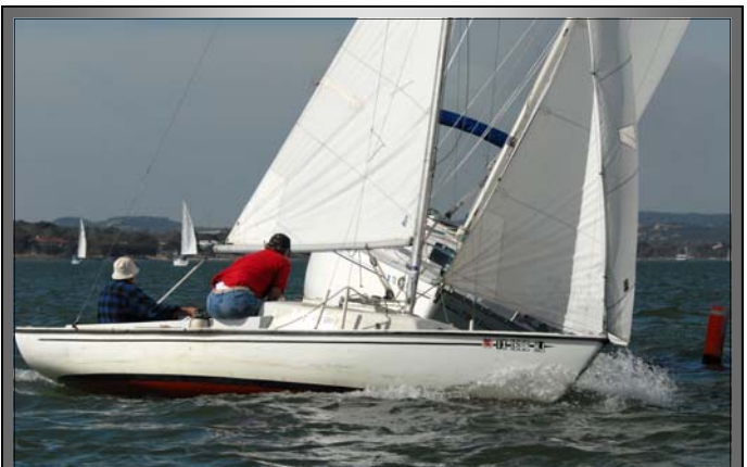
Duane Dobson holds spirited discussion of Rule 18.3 (b) with fellow non-spinnaker participant