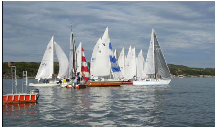
More than a dozen boats vie to cross the Frostbite finish line

It is not too late to join the fun and the weather looks promising for the rest of the Frostbite Series. So, dust off your boat and come join in.