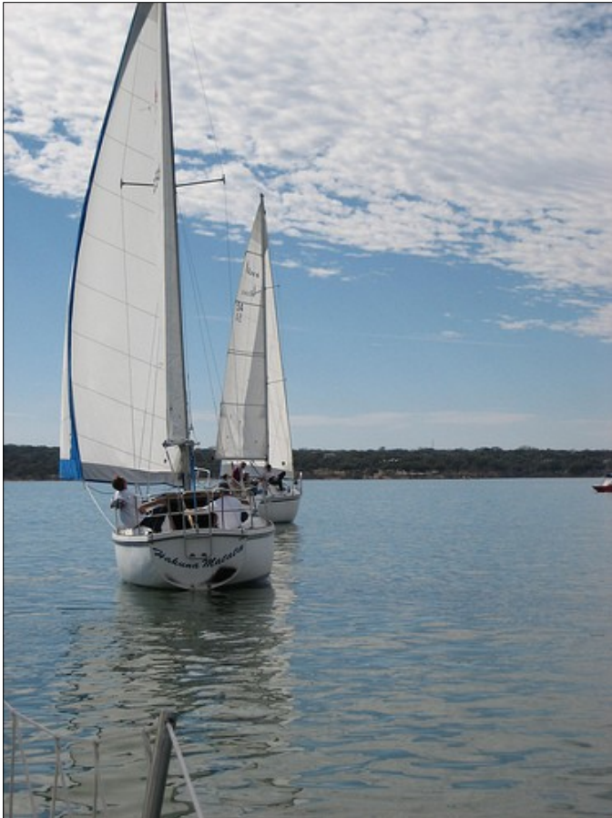
Hakuna Matata and Slow Play head for the finish