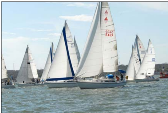
A beautiful day and a smooth start for the Non Spinnaker fleet at Frostbite

There are still a few folks left that have not yet renewed their membership. Don't miss out on the sailing, the parties, and the chance to have your say. You can email the fleet secretary at remus@lobos.net to have dues charged to your account. Or better yet, come out to race and talk to any fleet officer.