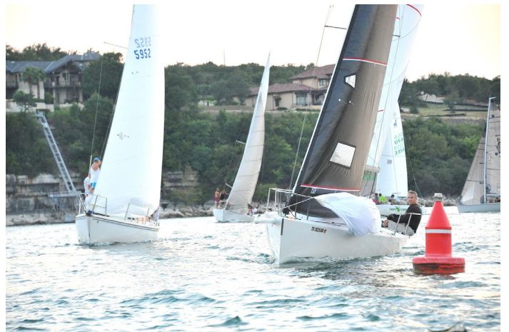
Moonburn Photos Bill Records