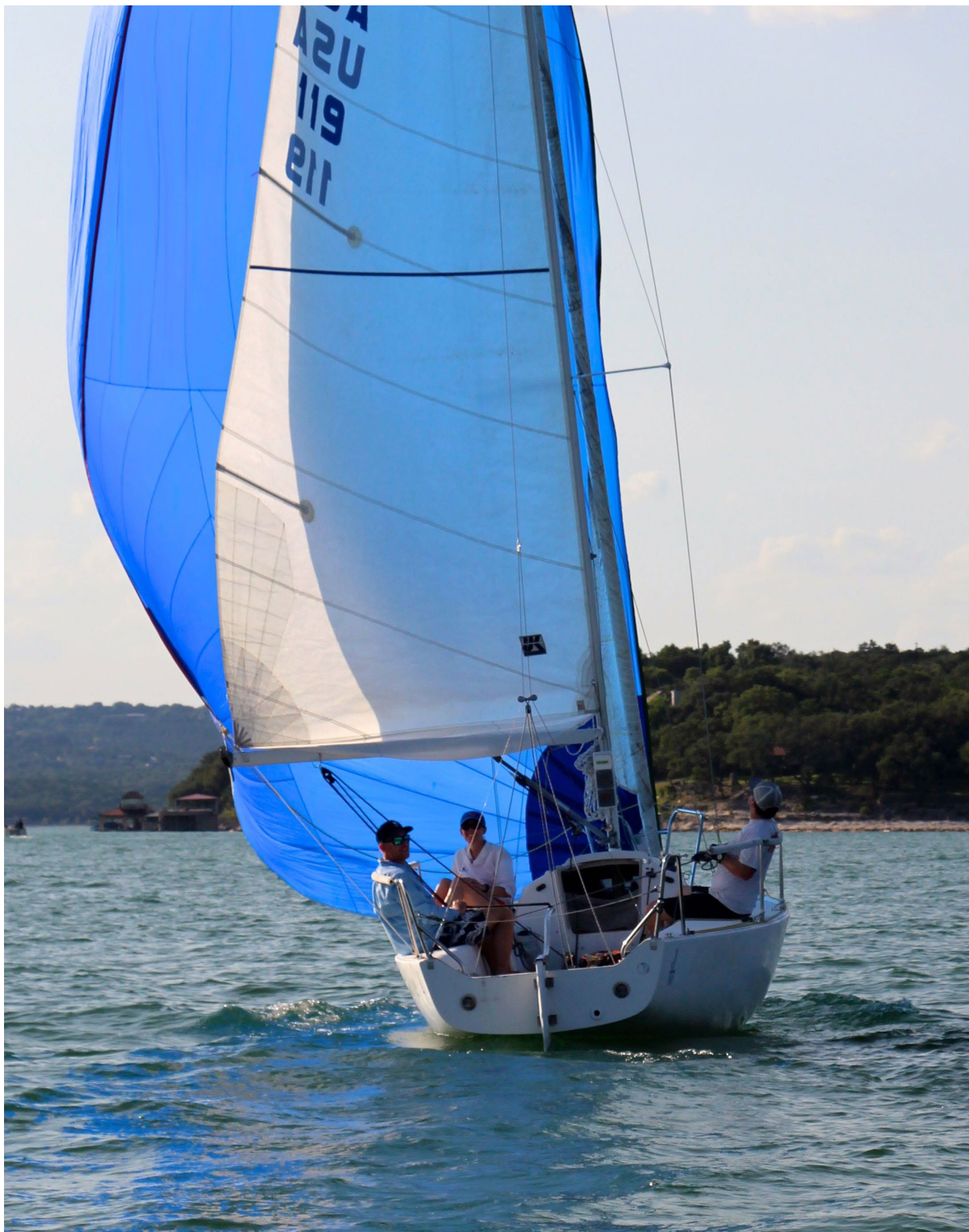
Dog Days #4