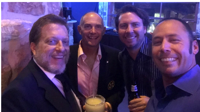
"Token C-fleet submission" from Andre de la Reza