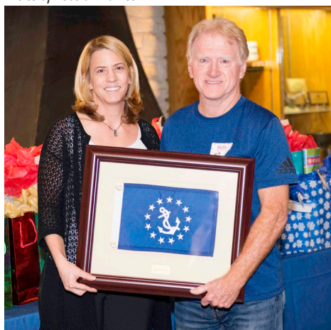
COMMODORE Wade Bingaman