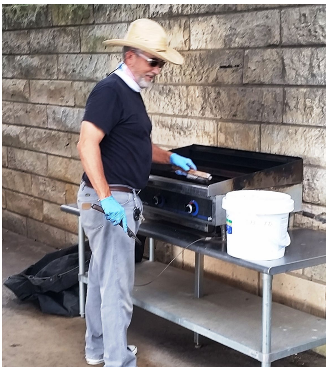
Doing the nasty (on the beer can grille)