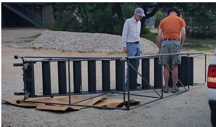
Stairway to heaven, under construction