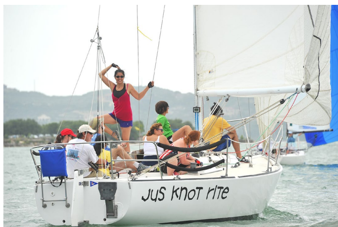
Independence Cup revelers (More photos on pages 10-11)

Next regatta is Keel Single-Handed on Aug 26, followed by Centerboard Regatta on Sep 16, 17. Kevin Reynolds , CB regatta chair, is looking for volunteers. New members can check off probationary requirements by volunteering.