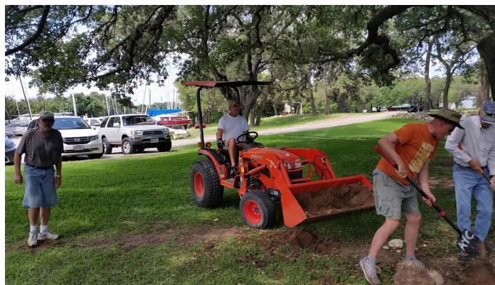
No tractor polishing going on here

The magnetic/dry erase message boards will be up in the restrooms soon. New display cases for the north side of the clubhouse are in hand and will be mounted also.