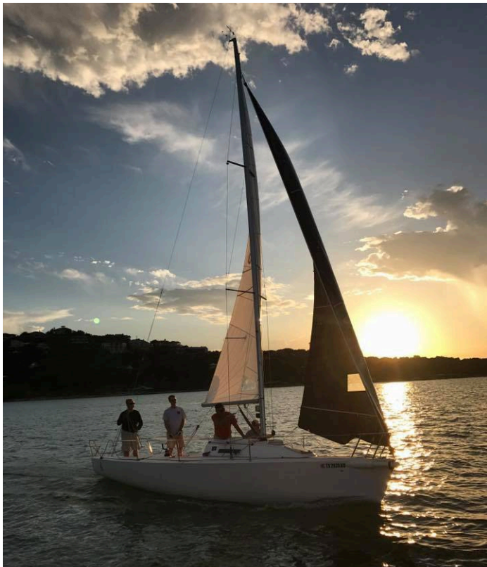
Nice shot of Air Supply at the MoonBurn Race

The third Moonburn race was held July 7. The J 80 – Air Supply, the J 29 – Jus Knot Rite, and the SB 20 participated in this race. The race was postponed after a nearby thunderstorm brought high winds to the lake just before the scheduled start. After the delay, A Fleet boats finished 1,2, and 3 as the overall keelboats, with the SB 20 in first, followed by Air Supply and then Jus Knot Rite.