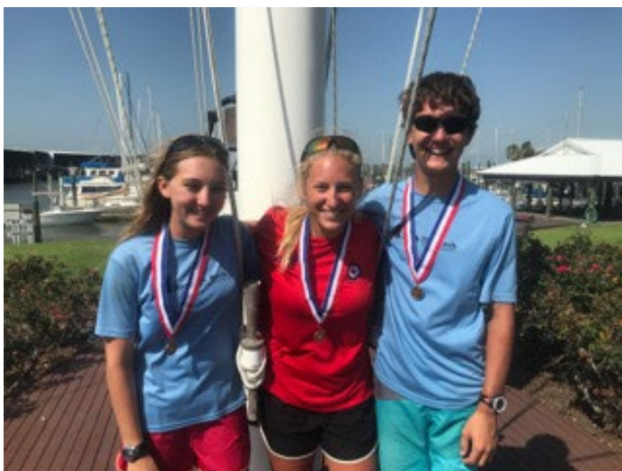
Rockin' Rockport Racers