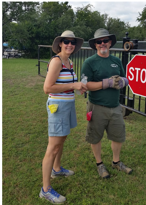
Front gate beautification crew