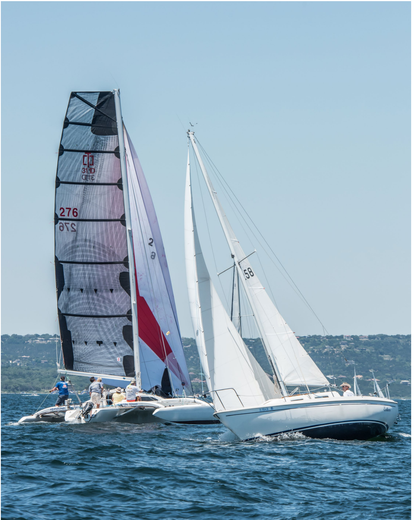
Summer Series Race 2