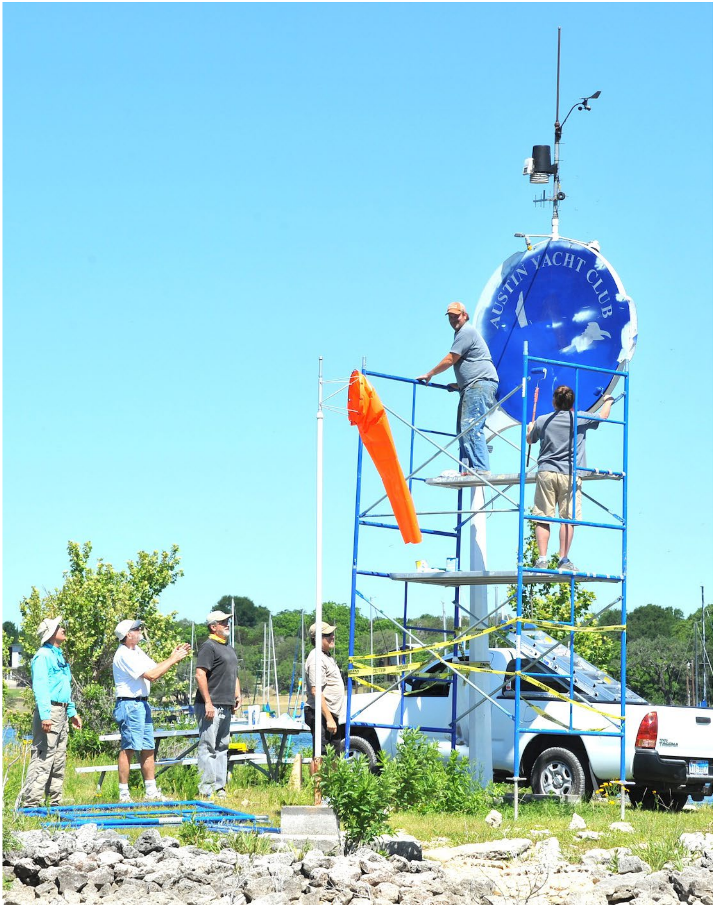
April Work Party