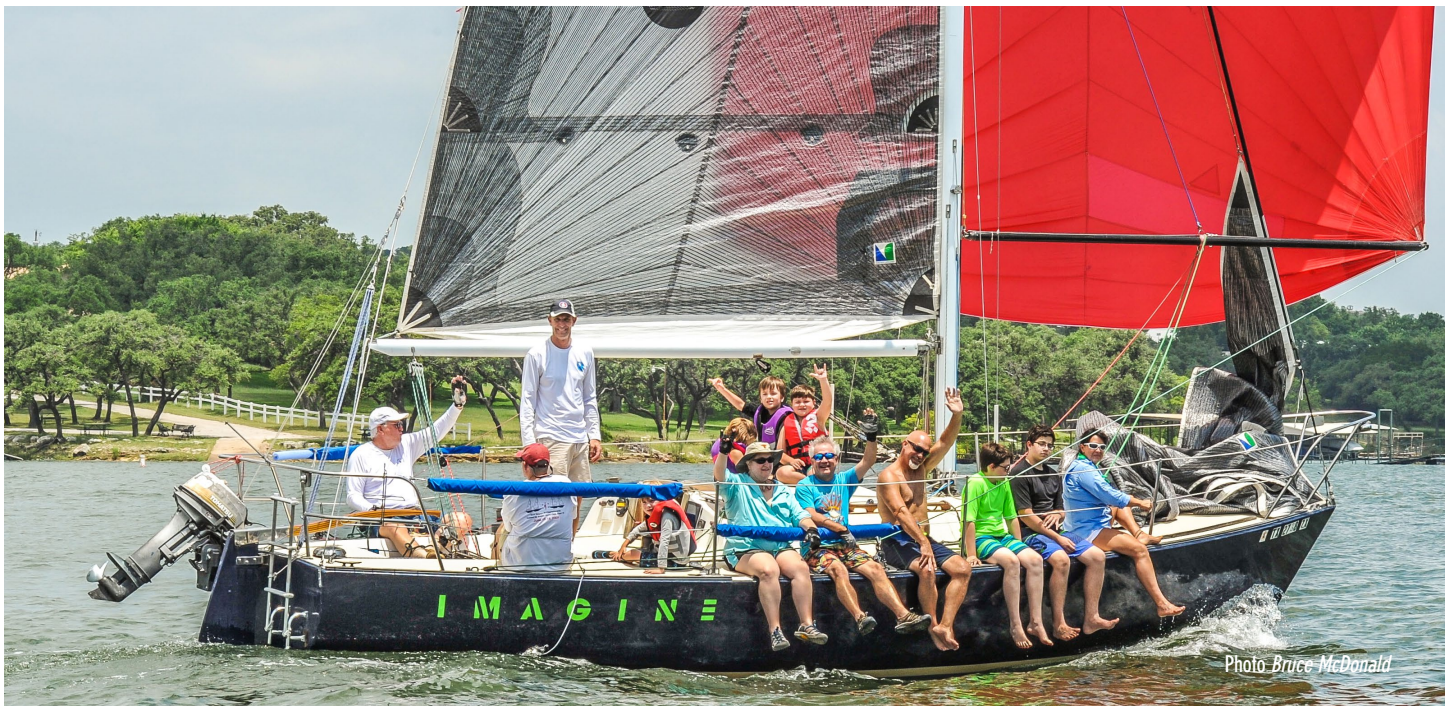
Turnback Canyon Regatta 2016

Turnback has been a legendary part of AYC's history, and the story only gets better this year! The 2017 version of the Turnback Canyon Regatta promises to be an excellent event thanks to all our dedicated volunteers and our great AYC staff. Hope to see you there!