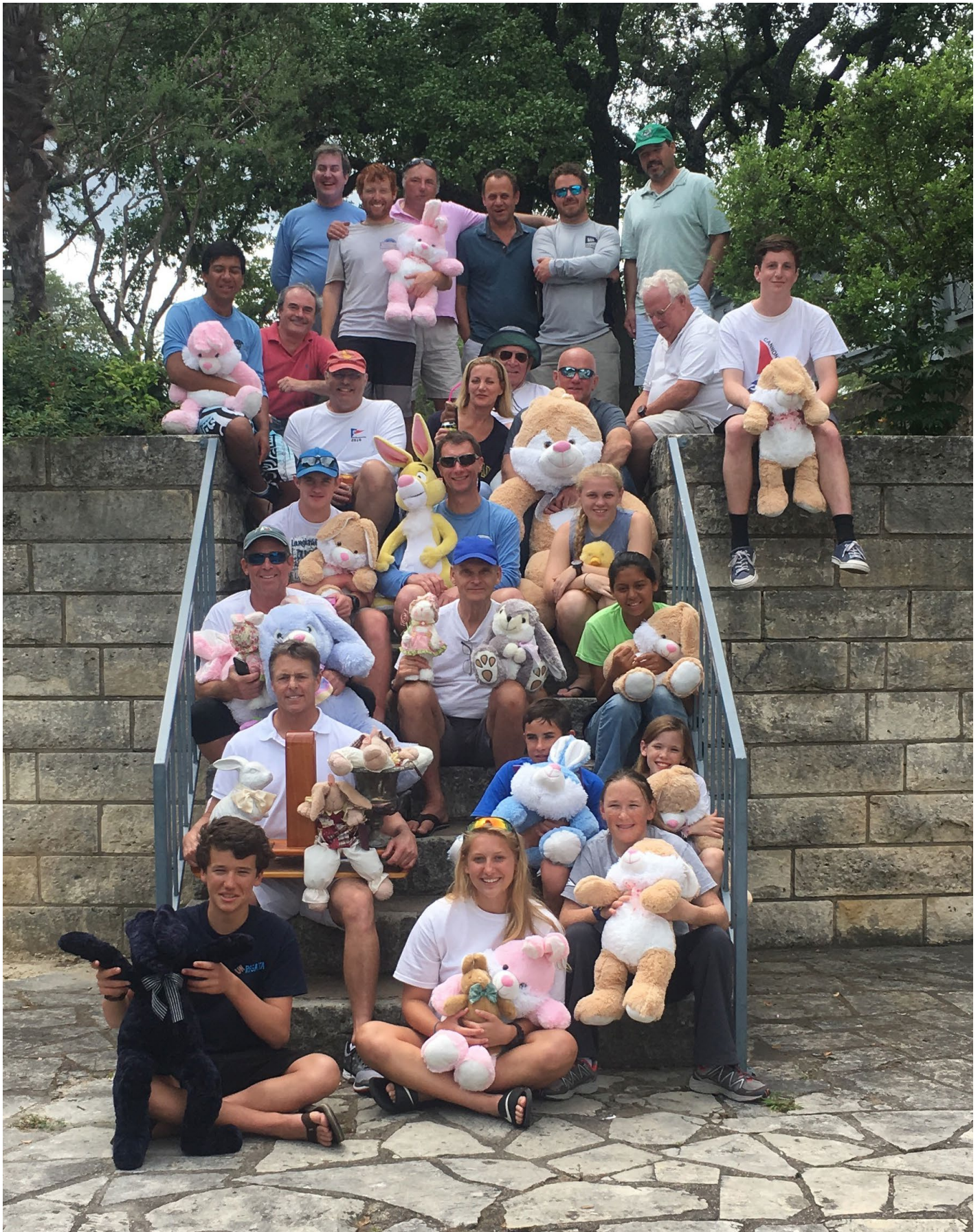
Easter Laser Regatta Participants