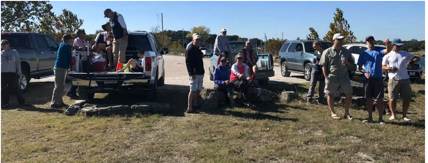
Wild Turkey spectators on the point