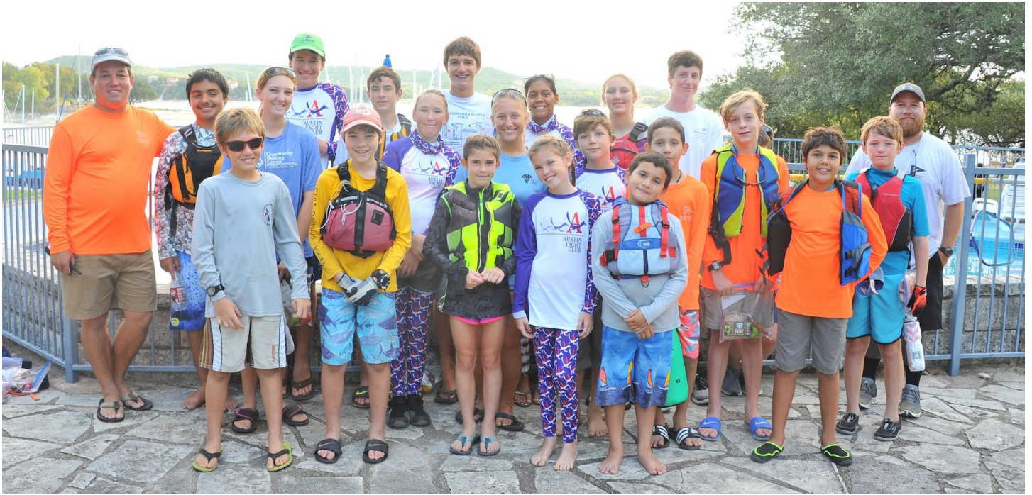
2017 AYC Roadrunners