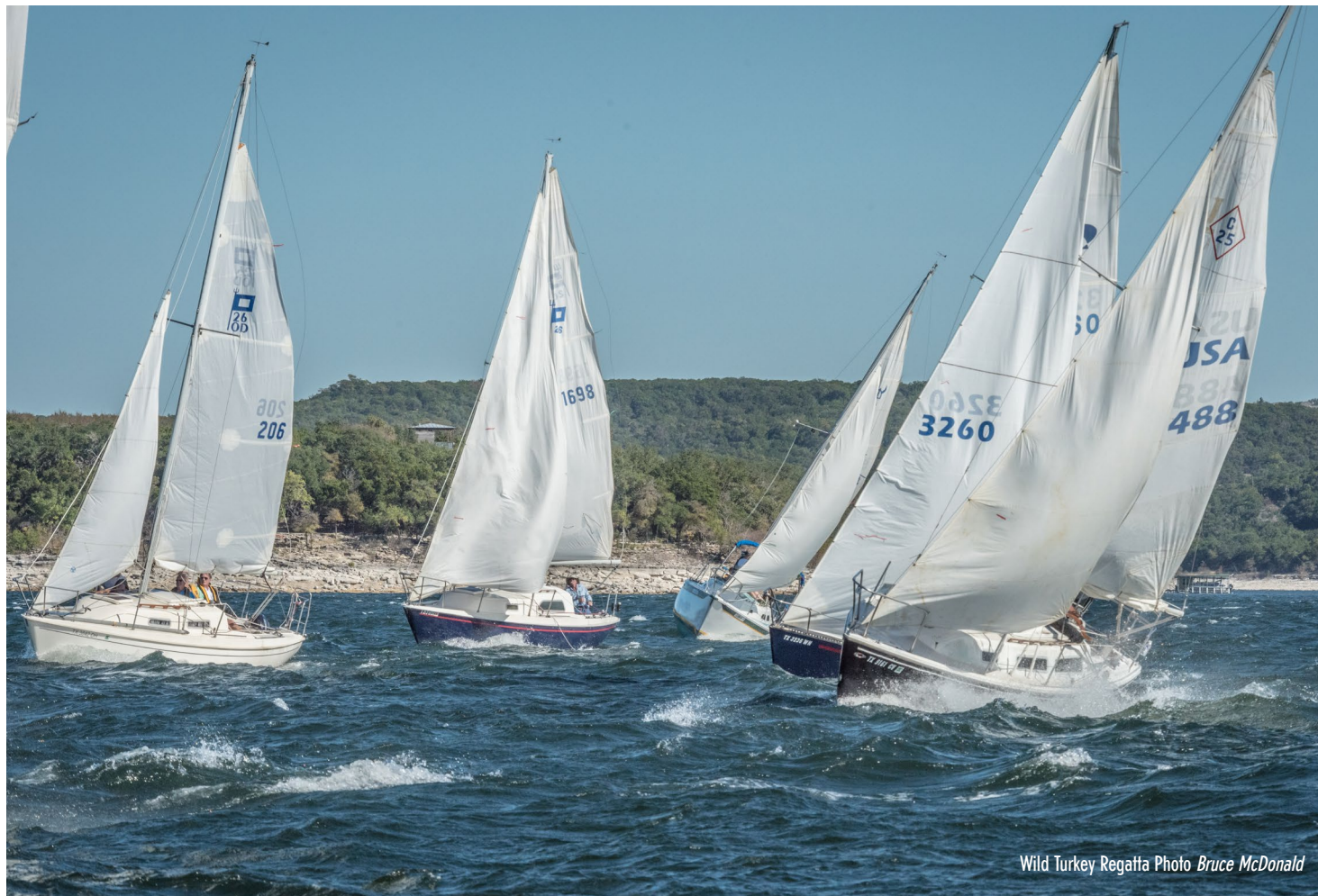
Wild Turkey Regatta