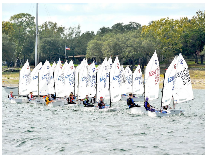
Opti Fleet Photos Bill Records