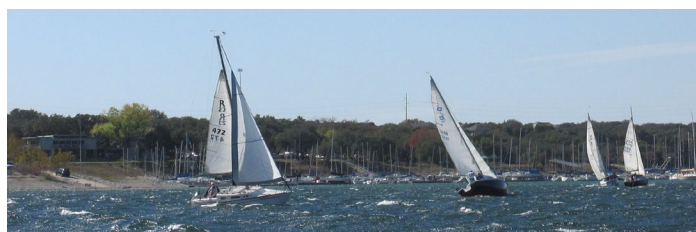
Reefed mains and small jibs

After the A Fleet boats rounded D mark, the C and D fleet boats, which had all decided to race non-spinnaker, approached, rounded the mark, and with small jibs and some reefed mains set course for a fast trip downwind to LCRA Mark 4. Caveat and Cafe au Lait led the fleet down the lake with the others following. Jibes were done carefully, and the boats rolled from side to side as they were blown quickly down toward the dam.