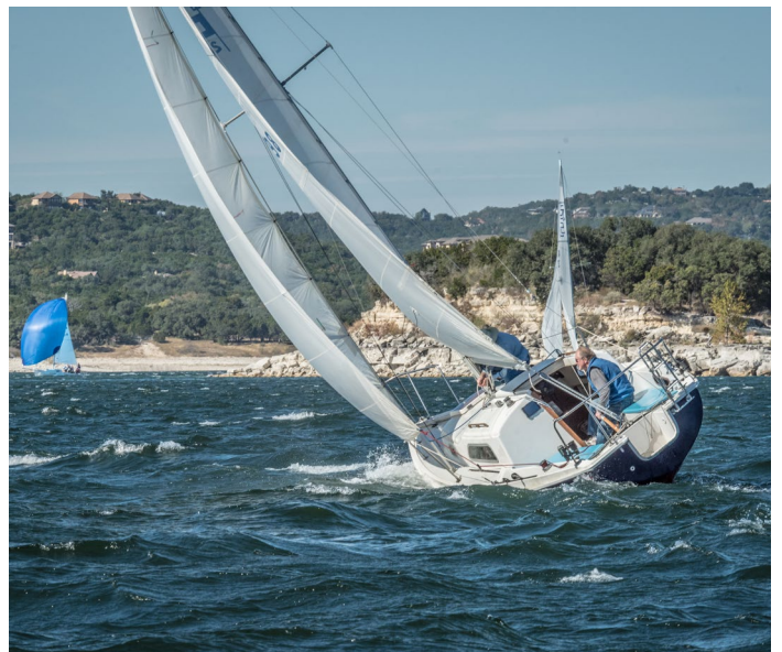
Wild Turkey Regatta