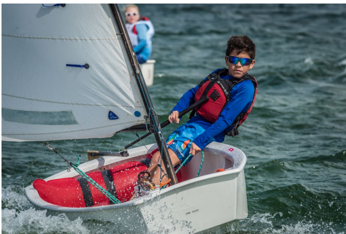
Opti Green Photos Bruce McDonald