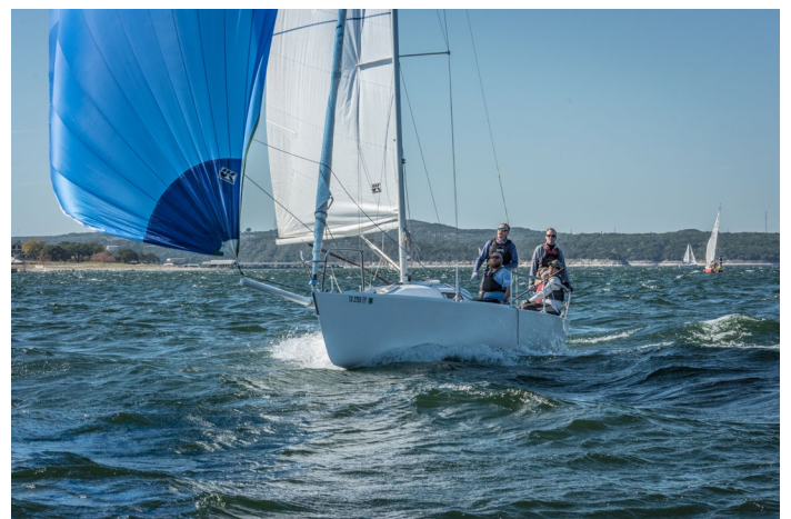
Wild Turkey Regatta Photos Bruce McDonald