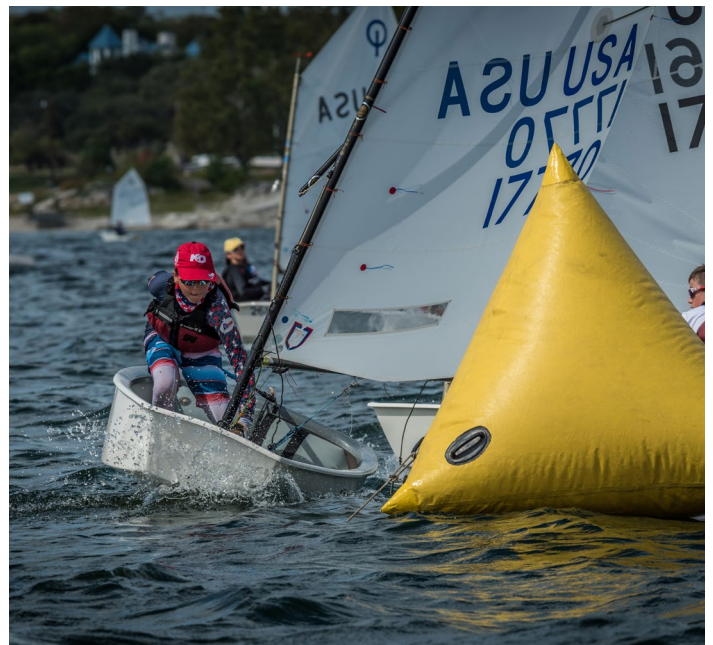
Opti RWB Fleet Photos Bruce McDonald