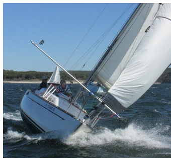
Ranger 23 just before calling starboard on the RC boat

Once out on the lake we monitored the winds and saw a maximum gust of 27 mph. The winds were steadily in the 15-22 mph range, but no gusts over 30 mph were observed. The boats that were sailing around the start line were managing the winds well, no one appeared to be too much out of control, and the competitors were set to test their high wind skills in the breezy conditions. The starts went off well, with the only casualty being a video camera on the Ranger 23 which went swimming when they decided to call starboard on the