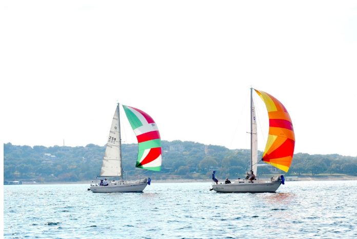
Fall Series Photos Bill Records