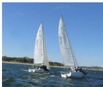
J80s heading upwind after the start

As the boats sailed up toward the first mark, "D" mark, crews were drenched,