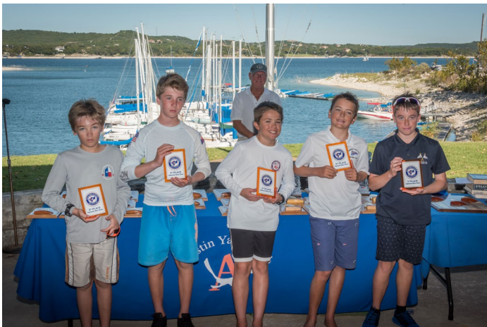
Roadrunner Regatta Award