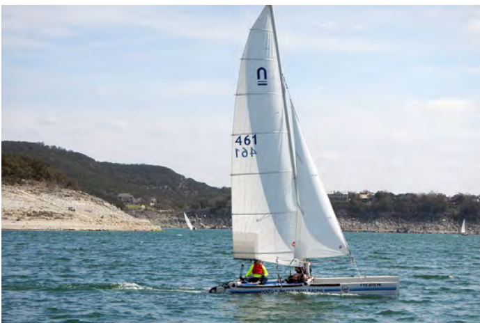
Nacra 5.7 Old Skull