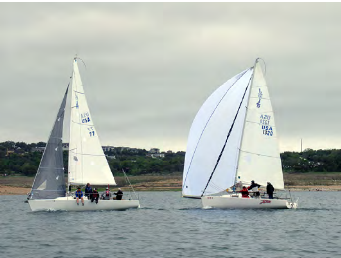
J80s L-R: Warp Speed and Speed Racer