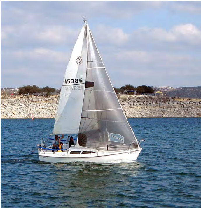
Catalina 22 Elysium