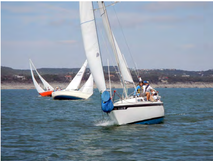
Pearson 26s Incognito and JustUs approach Catalina 27 Nancy O