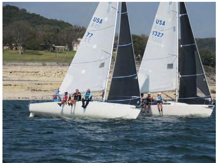
J80s Warp Speed and J Eagle