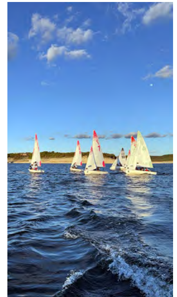
High School A team sailing E420s

Lastly, our ILCA Racing Team has been gearing up for the Roadrunner Regatta and the long list of TSA events for the year. Stay tuned for photos and results in the April Telltale.