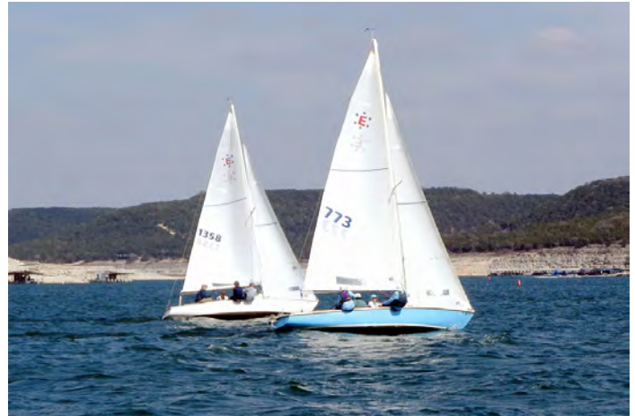
Ensigns Gravy Boat vs Eagle