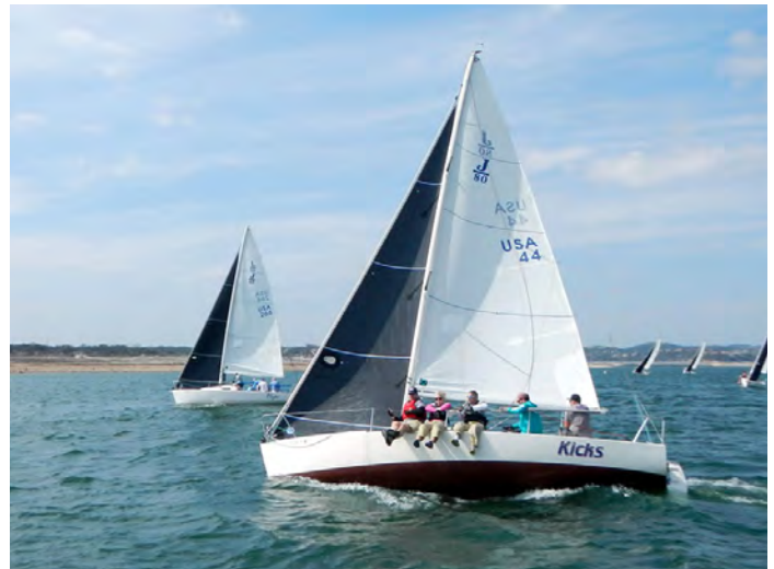
J80s Flyer vs Kicks