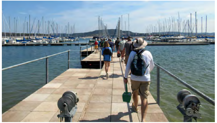
Mad rush to the boats after skippers' meeting