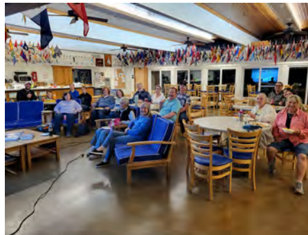
Mar 1, 2024 21 sailors attended Movie Night