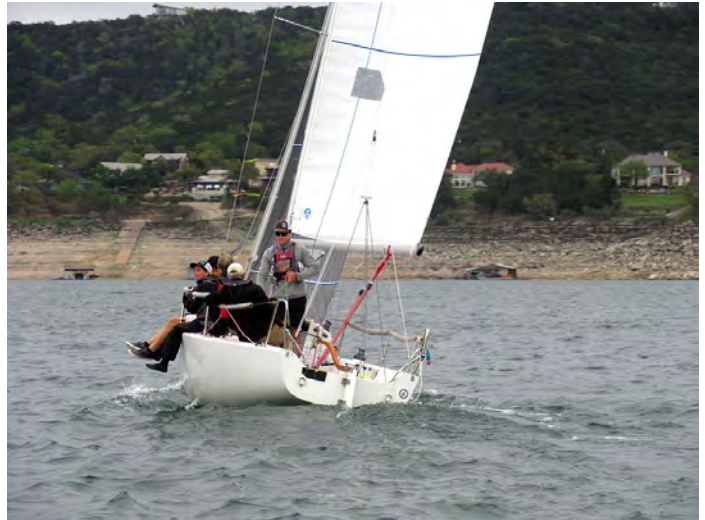
J80 Warp Speed