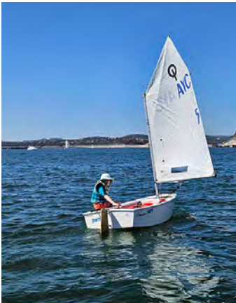
Opti II: Intro to Green Fleet class

In March, many Opti III sailors resumed sailing after a long winter hiatus. Fortunately, the winter winds have persisted, providing us with breezy practices to better prepare for those windy race days when foul weather gear becomes essential.