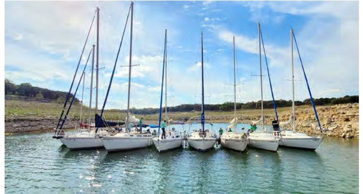
Catalina Fleet 69 Raft-Up on a Catalina 22

For more information, contact us or go to https://www.catfleet69.org .