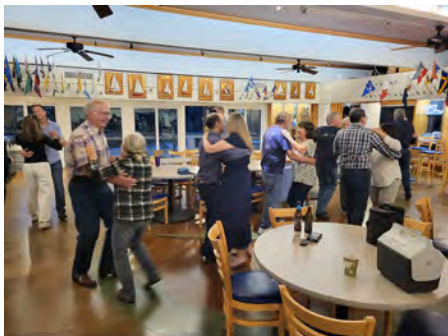
Mar 13, 2024 Country Two-Step Dance Lessons