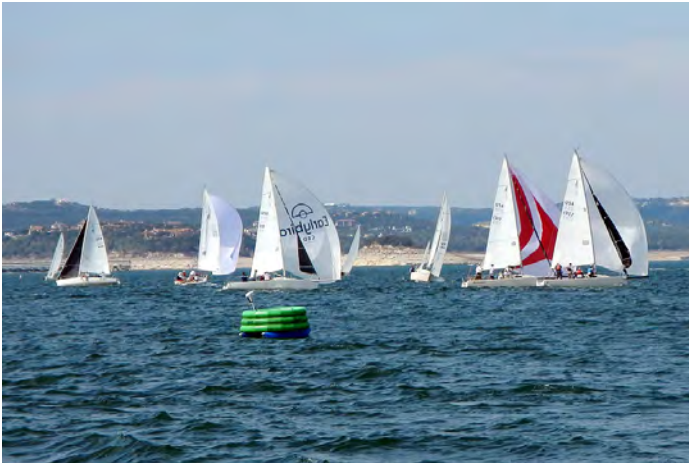
Racing J80s and a Pearson 26