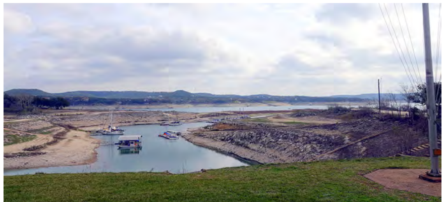
View of the AYC Marina, Opening Day 2024