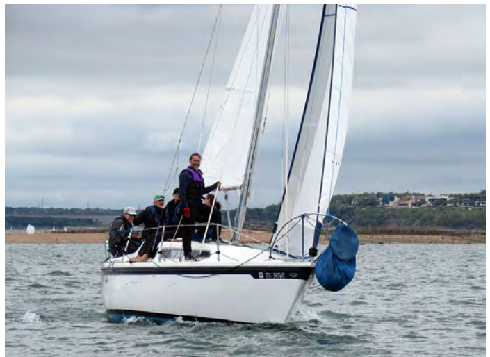
Catalina 27 Nancy O