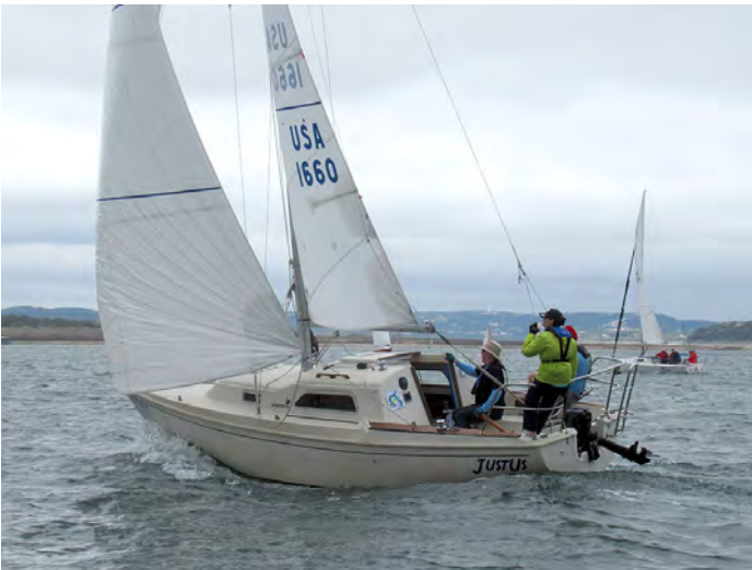
Pearson 26 JustUs