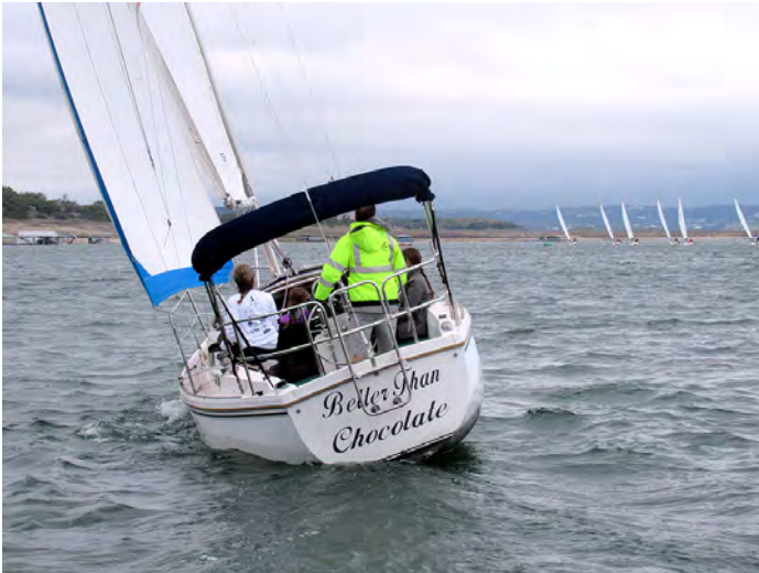
Catalina 27 Better Than Chocolate