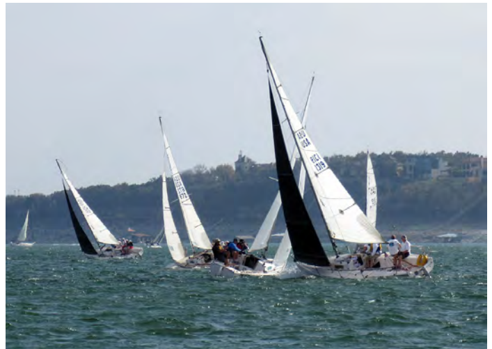
L-R J80 J Eagle, J22 Silicon Ship, J22 Project Mayhem. J80 Jackrabbit, J80 Air Supply