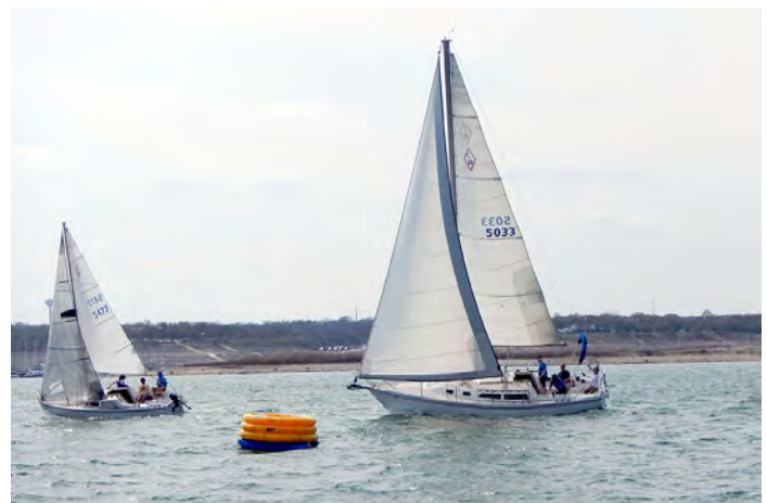
B Fleet Catalina 22 Moonlight Sonata and Catalina 30 Risin Moon