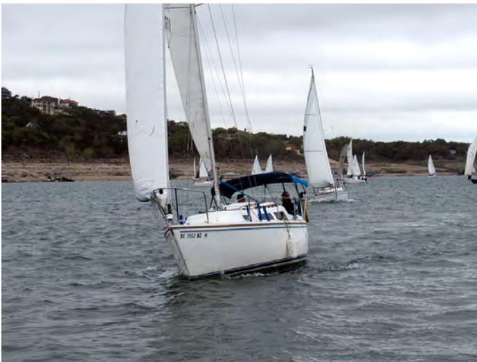
Catalina 25 Waturi