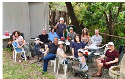
Pearson 26 Spring Party

On March 23rd we had our fleet meeting where we discussed hosting the Single Handed Regatta on May 25th. We hope it will be as successful as last year's. Also, we are planning a dinner cruise to one of the lakeside restaurants. The beautiful spring weather should bring out more boats for the Spring Series.