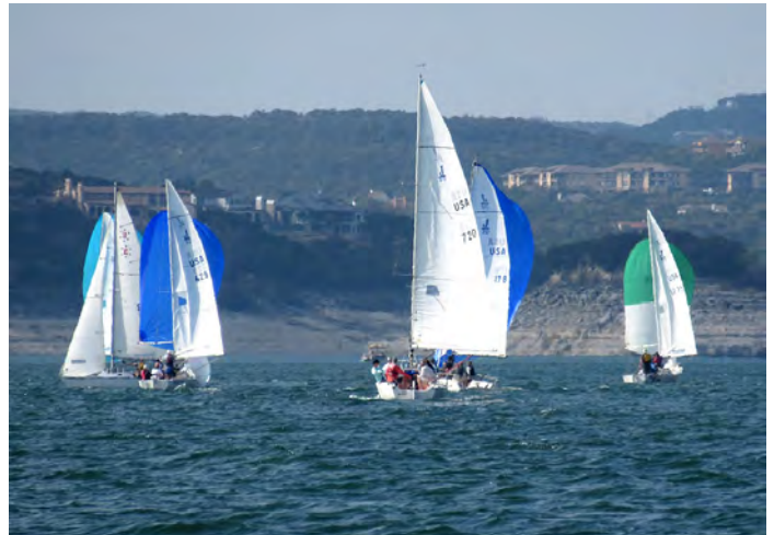
J80s downwind