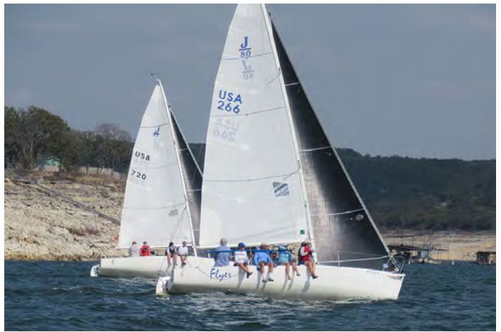
J80s Air Supply and Flyer