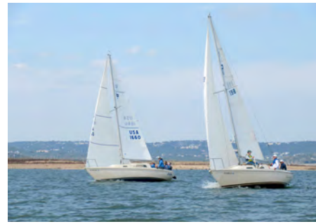
Opening Day – JustUs and Cafe au lait

The start was very competitive, with most of the fleet sailing east. JustUs was forced to tack and took a flyer to the west shore. That turned out well and when they tacked back, they were in the lead! The fleet stayed together except for Rusalka, whose dirty bottom slowed her down. JustUs and Cafe au lait traded tacks to the weather mark. JustUs's new North sails were not only beautiful but fast! On a