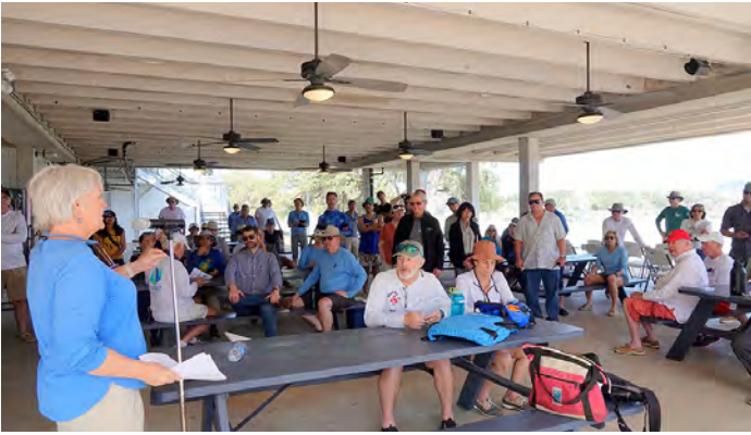
Skippers' meeting