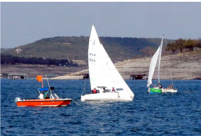
PHRF J boats – J22 Bonfire and J70 Wabisabi