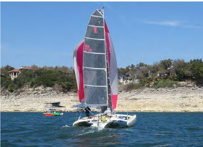
Corsair F27 Trinity