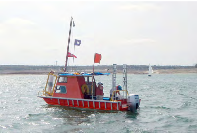
Board of Directors served as Race Committee