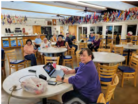
Feb 16, 2024 Sailors playing Pub Style Trivia