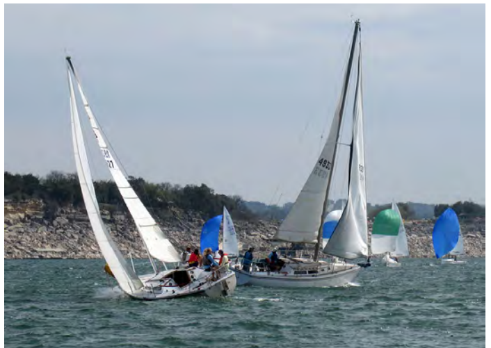
Capri 25 Ornergy and Catalina 30 Rendezvous