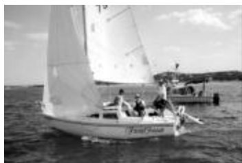
The "bullet meister" himself Larry Hill with Becky Waddell and crew.

If you have been out to the lake recently you have noticed that the lake level continues to drop (currently at 645, according to Omar). In case you think the lake is going to run out of water, just last Saturday we an-