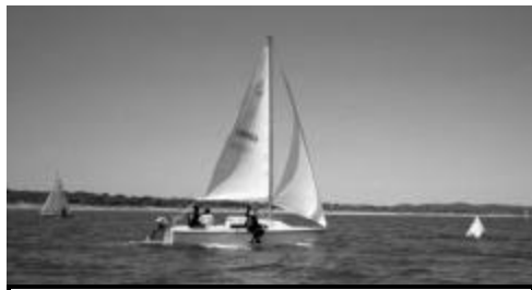
Omar Zia & crew Doug Reber on Harvest Moon.

large rattlesnake had gotten into the locker where RC keeps their flags. In the photo, you can see the race committee proudly displaying their trophy. Lucky thing no one reached in for a flag and got bitten.