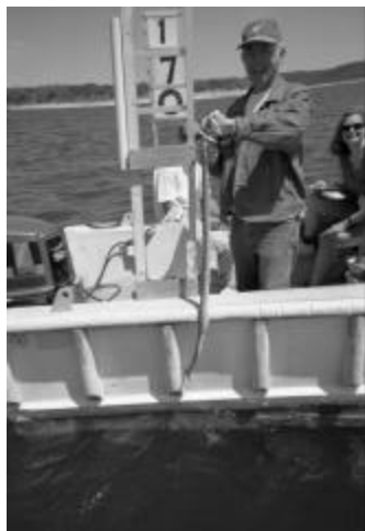
RC proudly displaying a rattlesnake which got into one of the lockers on the RC boat.

Race #5 of Spring Series was beautiful weather with powered up sailing and continuous whitecaps on the water. Upon passing by the stern of the race committee boat to check in for the first race, I was met with a shriek from the lady on the back of