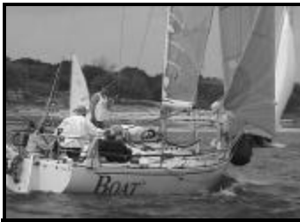
Imre Szekelyhidi on Boat II during the Spring Regatta.

I've really been missing the racing at AYC the last couple of months. Pulled the Hobie out in early April to get it ready for Lakefest Regatta on Lake Texoma. At the same time I had it up for sale, expecting a 6 month sales cycle, and it sold a week after I brought it back. Anyway, I haven't been out racing with the fleet and have had to gather information second hand. I was pleasantly surprised. We have had wonderful participation! Eleven A-Fleet boats participated in the Spring Regatta and ten boats raced in the Spring Series with four boats making it out for four or more races. The only larger fleet in the Spring Regatta was the Sunfish Fleet. Congratulations to Steve McKinley for winning the