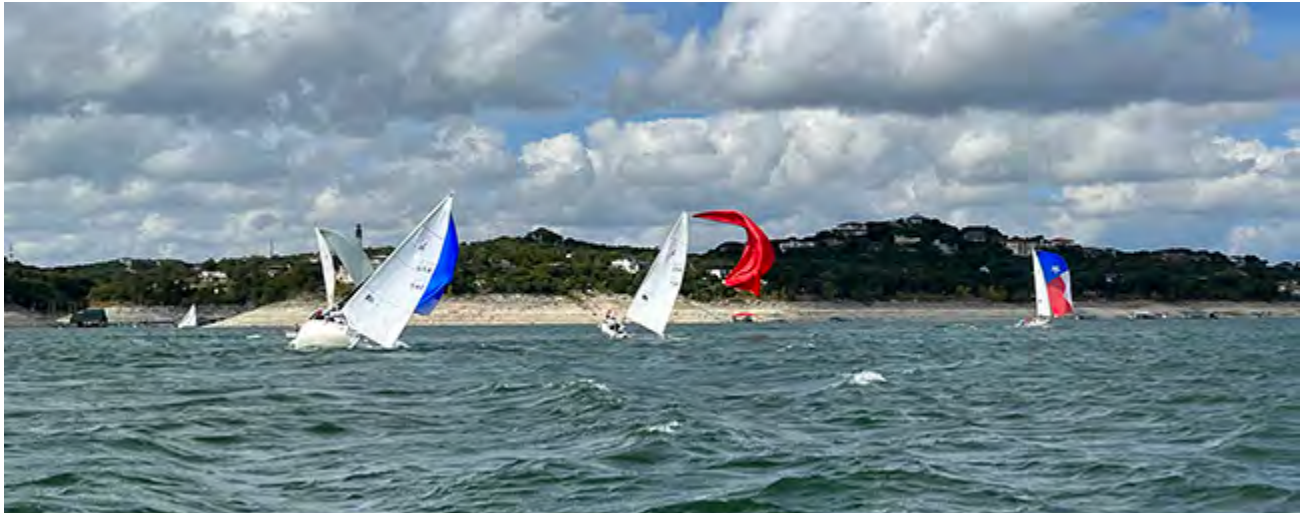
J/80s 540 The J.A.C.K., 720 Air Supply and 537 Sweet T