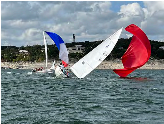
J/80s 537 Sweet T and 720 Air Supply