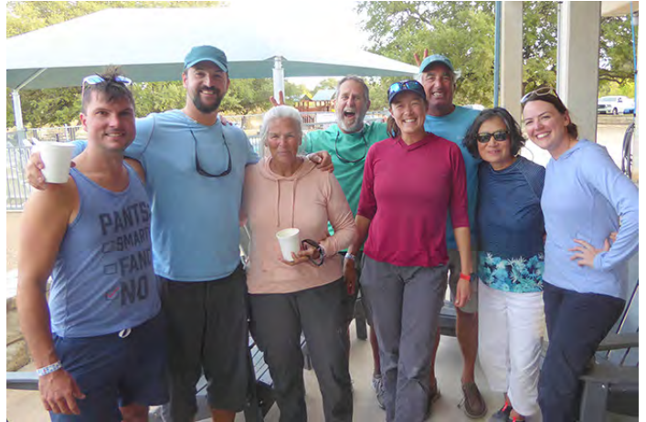
Worlows, Fricks, Caseys and crew