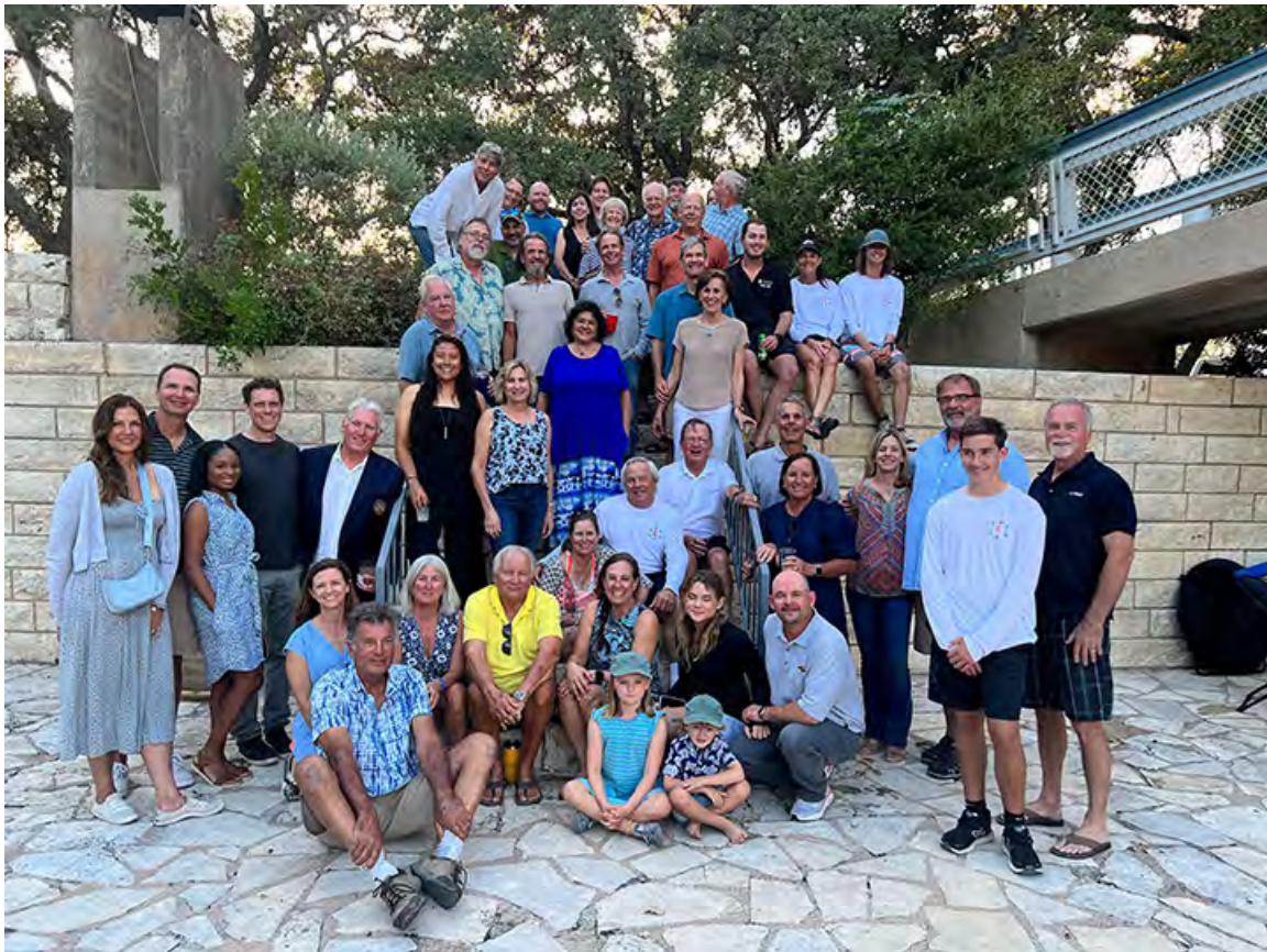
Generations of Ensign Sailors. Group includes seasoned and new sailors – for some, their fathers were the original Ensign sailors so they grew up with the boat.