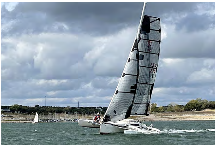
Corsair 31-1D 276 Abandoned Assets