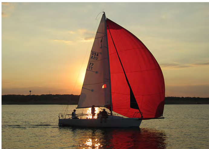
Kirk Livingston and crew on J80 Warp Speed