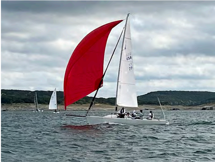
J80 77 Warp Speed