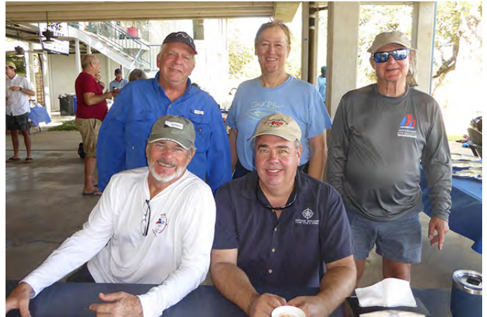
One of these is not named Steve