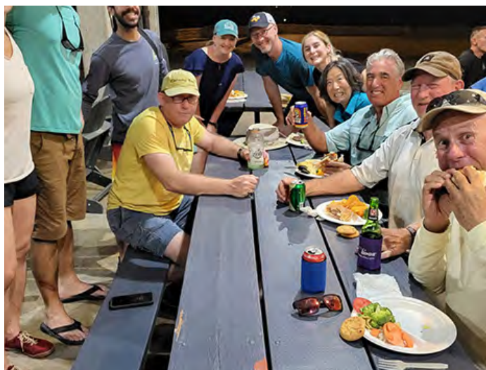
Happy sailors – last Beer Can supper