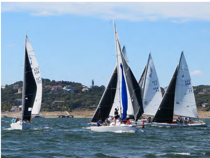
J80s rounding mark 6