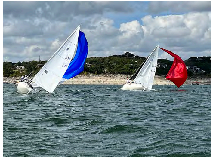
J/80s 540 The J.A.C.K. and 720 Air Supply