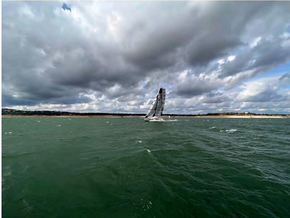
Corsair 31-1D 276 Abandoned Assets