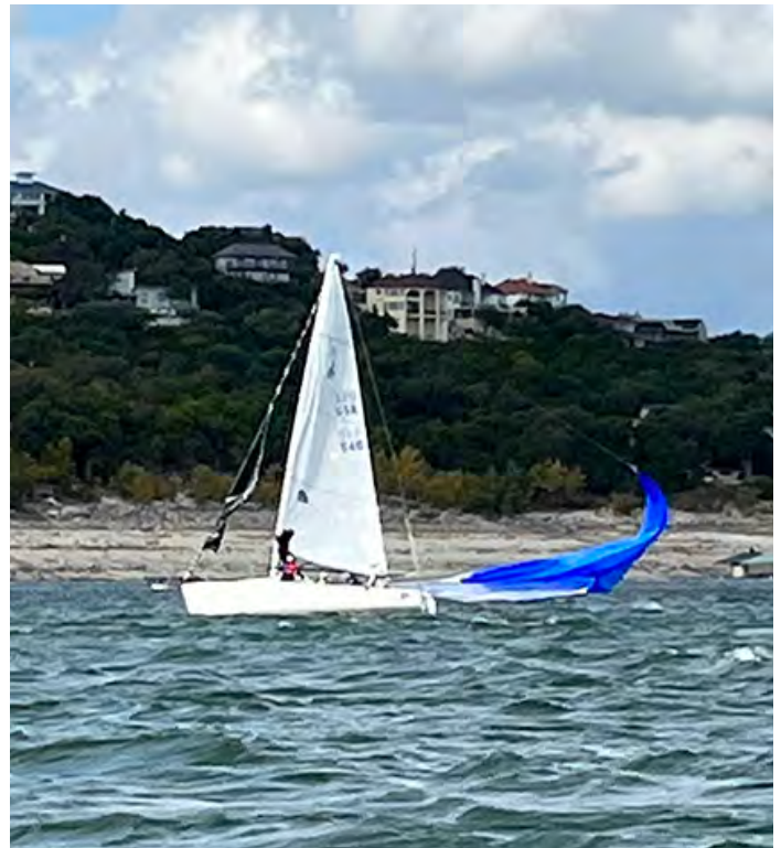
J80 540 The J.A.C.K shrimping