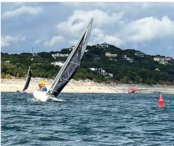
J80 to a mark