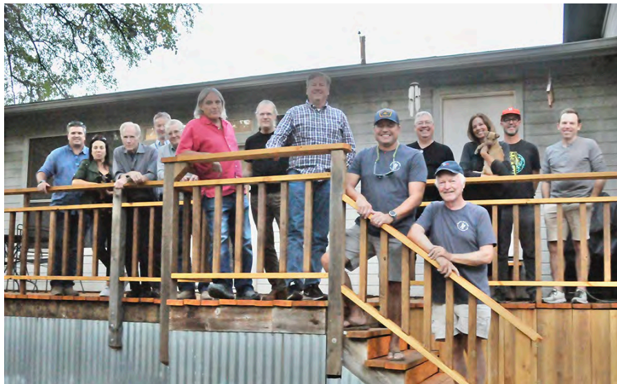
The Pearson 26 One Design Fleet