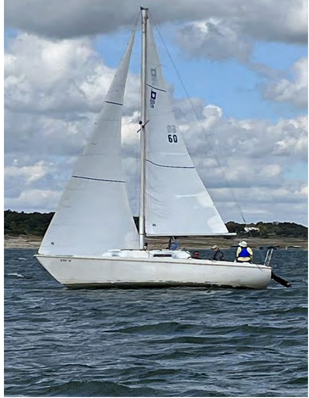
Pearson 26 60 Cloud 9