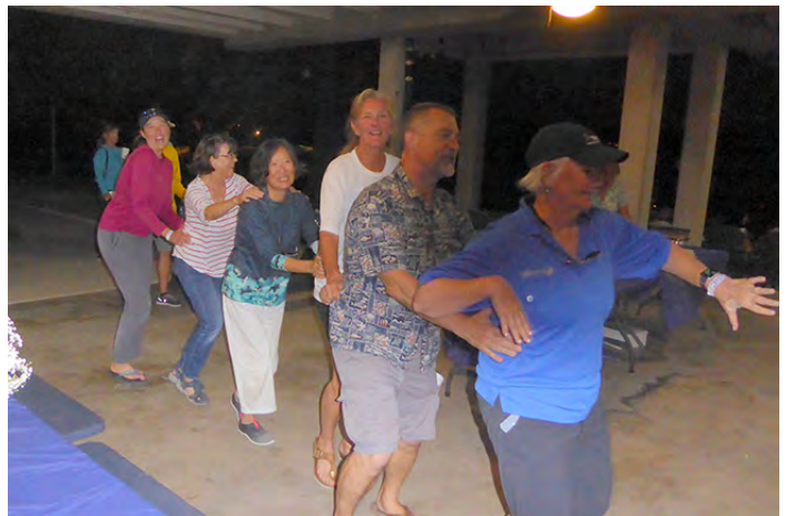
Conga Line Dancers