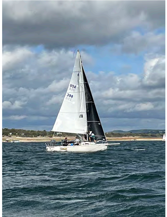
J80 398 Shotglass