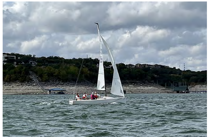
J/70 541 Jinn