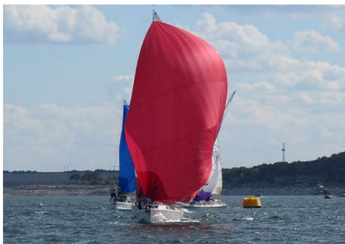
J80s rounding the mark bot