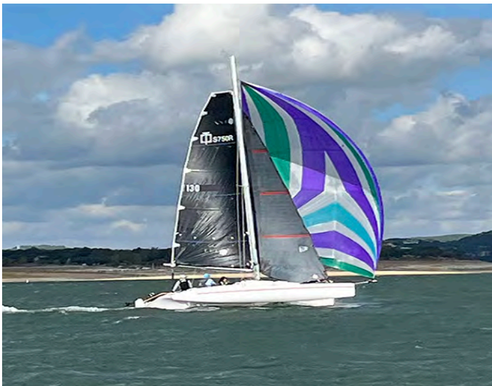
Corsair Sprint 750 Mk2 130 Humility