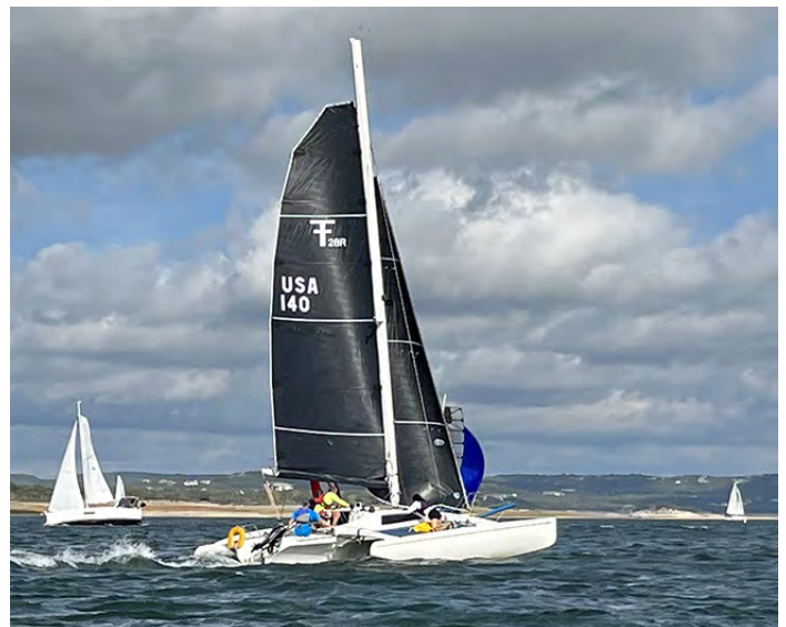
Corsair F-28R 140 Far Reach