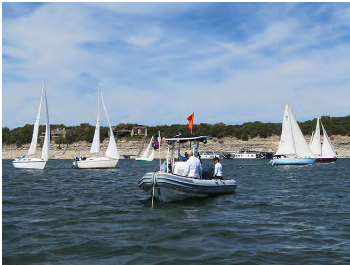
Pearson 26s starting Race 2