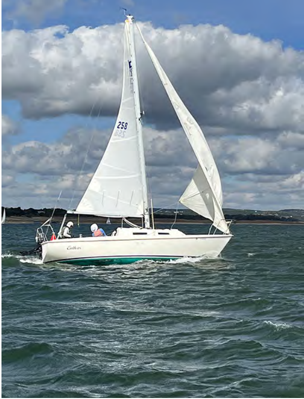
Pearson 26 258 Entheos