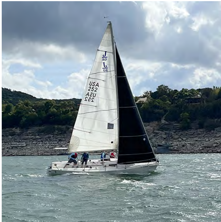
J80 252 Mucho Gusto