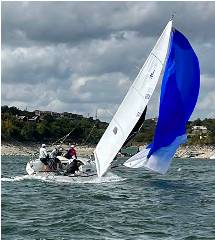
J80 540 The J.A.C.K