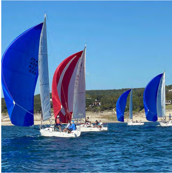
J80 fleet on downwind with JazzTacks in the lead

11/5 Saturday Race