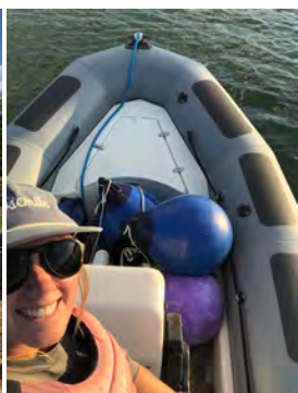
Blue RIB to grey RIB!

in October. She's been put in the water and down on the dock we also purchased this year. I'm looking forward to using it throughout the