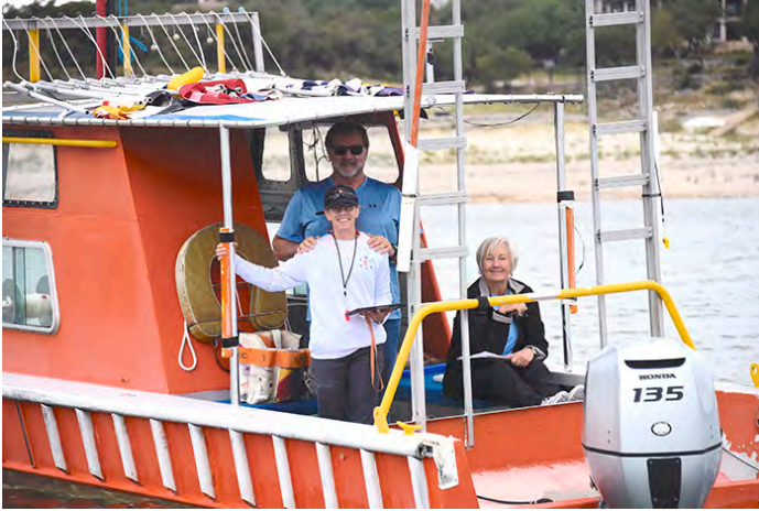
Thank you, Race Committee!