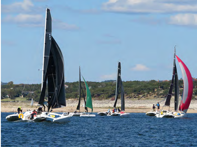
Start back to AYC