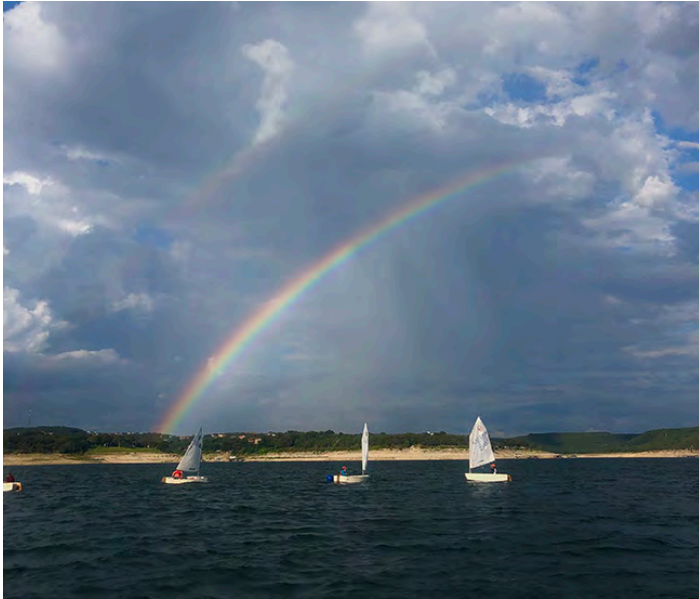
Rainbow over the Opti Endless Summer Series!