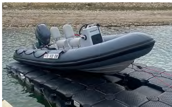
New Ribcraft 4.8 Coach on new dock!

in October. She's been put in the water and down on the dock we also purchased this year. I'm looking forward to using it throughout the