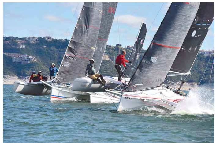
Battling it out