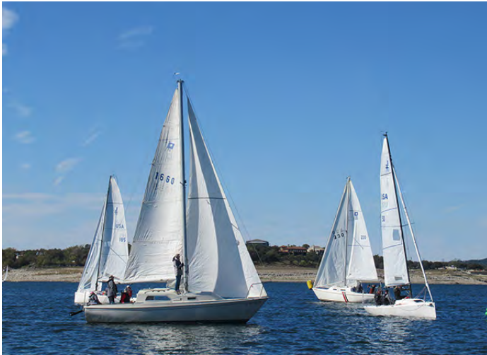
Ampersand – J70, Justus – Pearson 26, Jack of Hearts – Pearson 26, Rogue Warrior – J70

11/13 Sunday Race