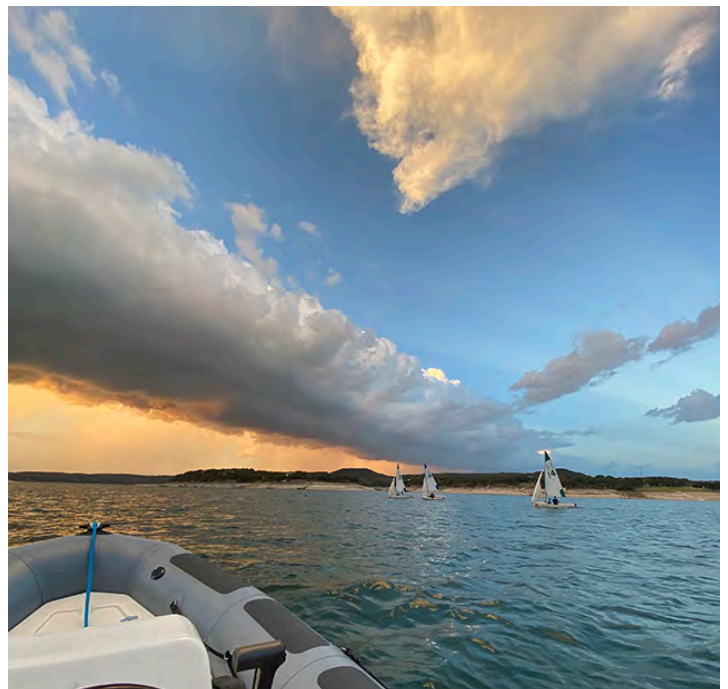
The sky showing off for high school practice right before we got caught in a downpour!