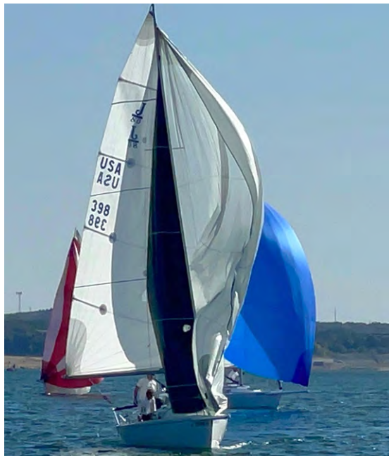
J80 spinnaker takedown- crew of 398 doing a great job