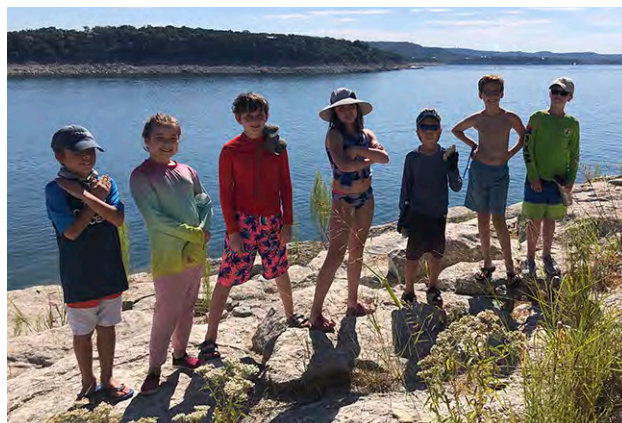
Opti I sailors visiting Starnes Island on a no wind morning

were always in good spirits and having fun with each other. All the sailors quickly learned about kinetics and how to move a sailboat with no wind and no motor, obviously. They even got the opportunity to become pretty familiar with the islands that we have access to here on Lake Travis. Starnes Island became known as Spy Kid Island (Spy Kids 2: The Island of Lost Dreams had some scenes filmed there) or Rattlesnake Island. As the lake level dropped, Sometimes Island became Sometimes Islands (plural), and finally, Sometimes Island again as they all connected. We took advantage of a short-lived Island closer to home off Travis Landing that we dubbed Sometimes Sandbar – although, it is no longer an island.