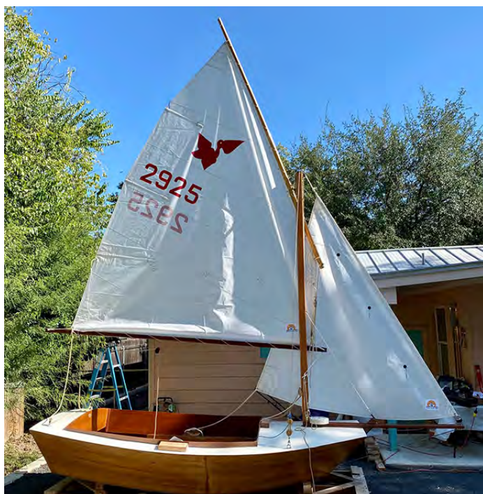
11/05 progress report: Getting closer