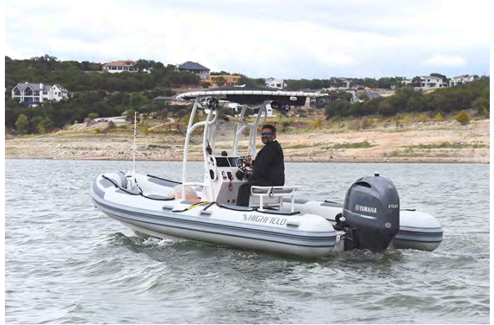
RC Bob Gross patrols the race course