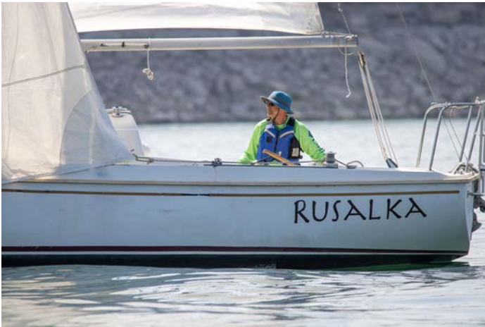
Pearson 26 Rusalka