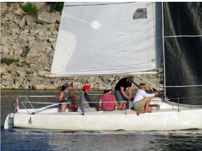
J80 Air Supply