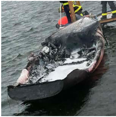
Ensign #4 aftermath of lightning strike

The weather conditions were challenging on the last day of racing, as a serious storm brought thunder and lightning as well as huge waves and