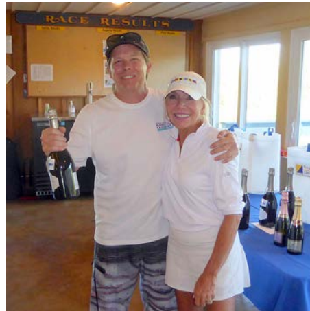
Laser 2nd Gray Rackley