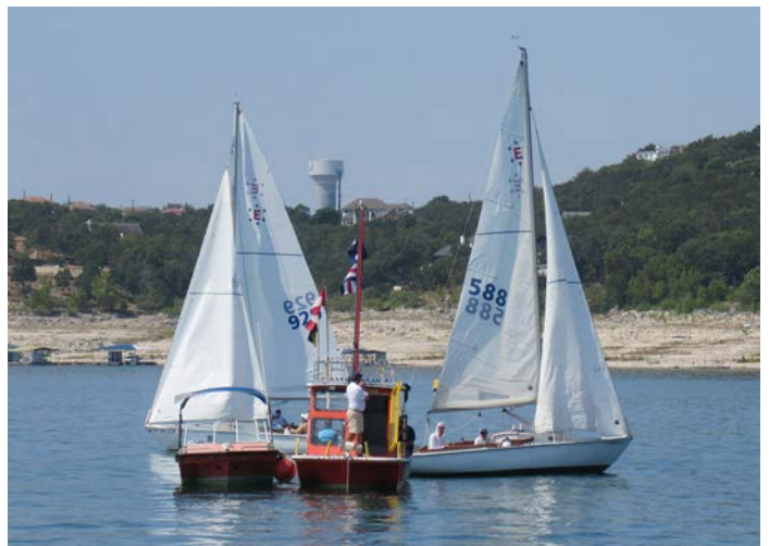
Dog Days 4: Ensigns Dos Locos and Stijf Kop with RC boats