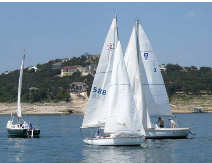
Dog Days 4: Catalina 22 Chili Verde, Ensign Stijf Kop, Pearson 26 Rusalka