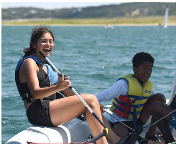
This camper had never sailed before attending Sail Strong Camp. She was asked to be on the high school team!