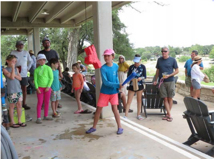
Pinata full of candy doesn't stand a chance