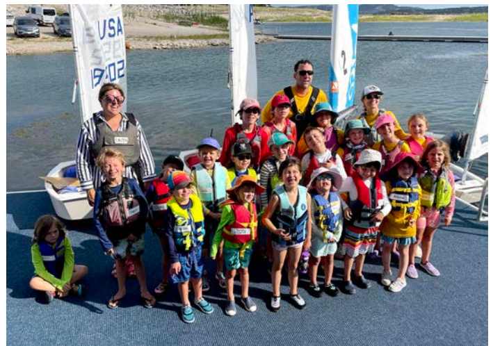
Group photo of one of the three classes