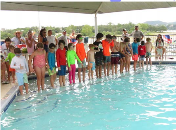
Diving for Dollars game lineup