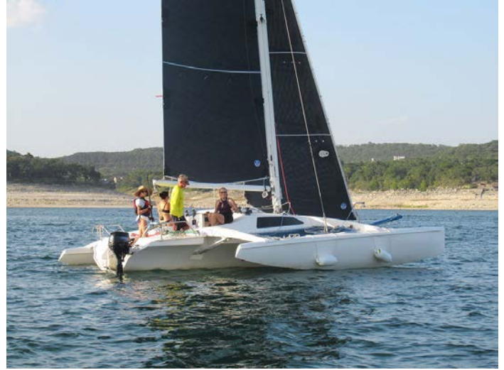
Trimaran F-28R Far Reach