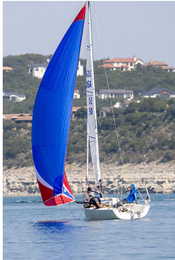
J70 Rogue Warrior