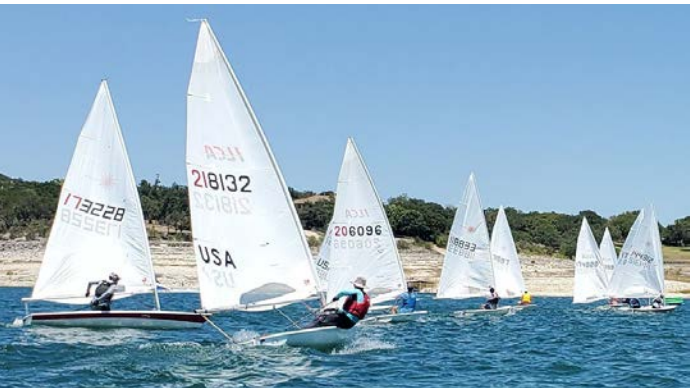
Lasers