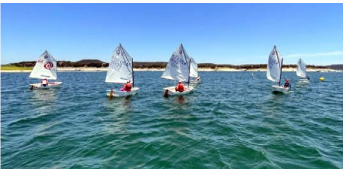
Opti racers