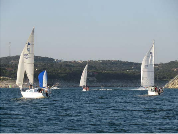
Pearson 26 Chips Ahoy, J80s Blood Sweat and Tears and JazzTacks, Pearson 26 Jack of Hearts