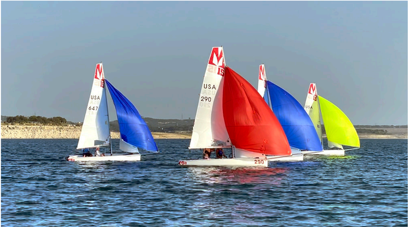
Thursday Night Racing: Melges 15 Fleet is a commanding presence on the Lake.