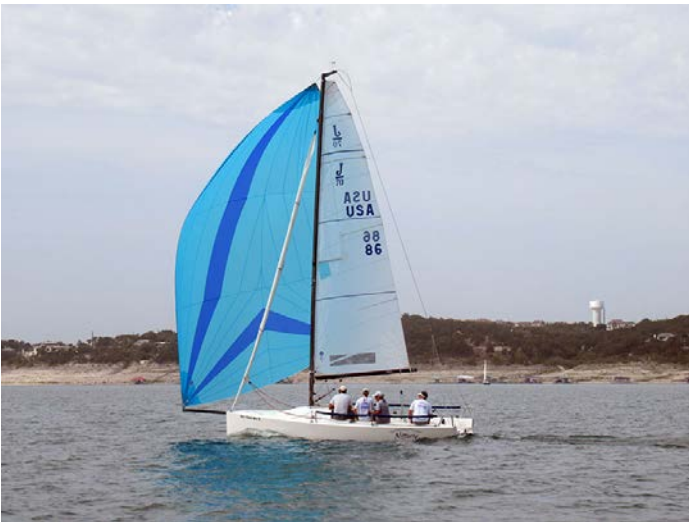
Dog Days 3: J70 Nittany