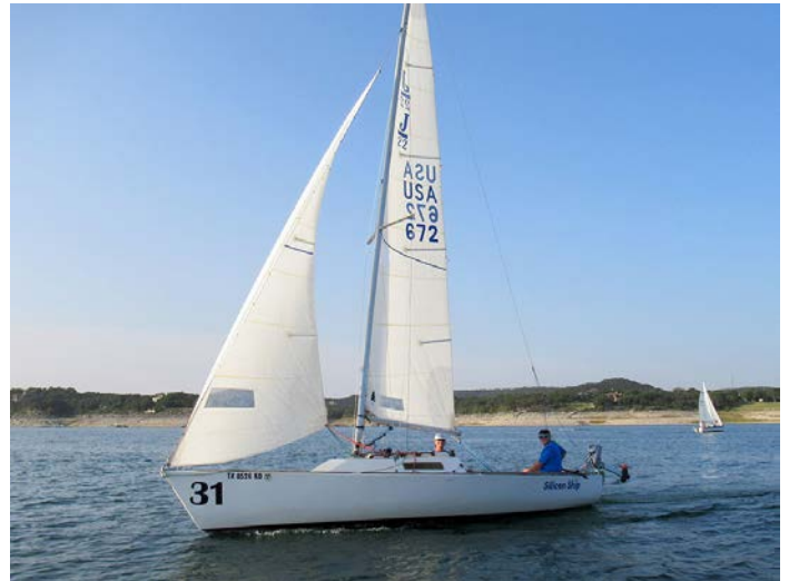
J22 Silicon Ship