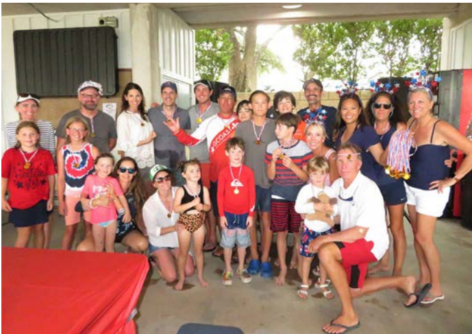
★ The Winners!