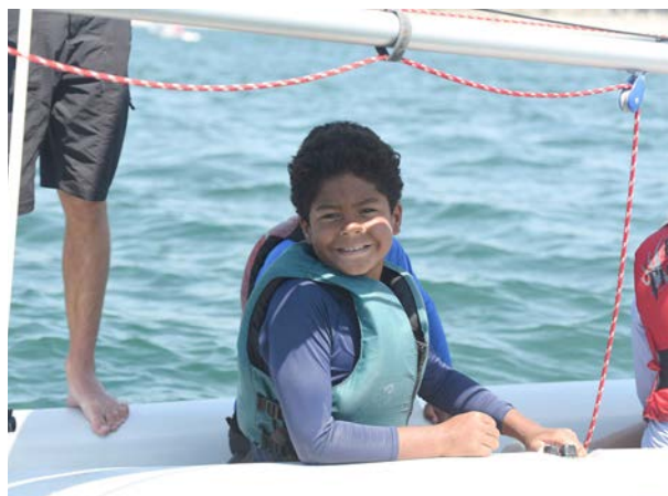
All of the campers want to come back next year!