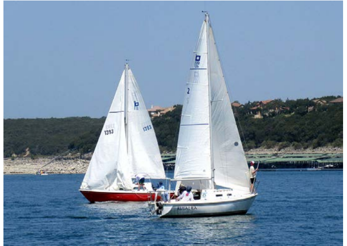
Dog Days 3: Pearson 26s Incognito and Rusalka