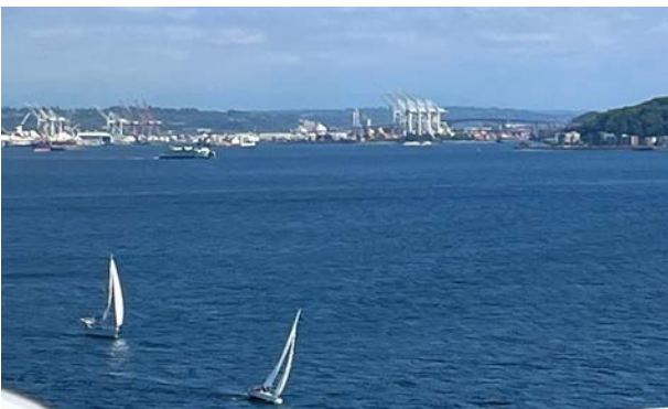
This is how my boat looked from the cruise ship.

It was nice on the sail that I was able to let both women and 2 of the kids drive and learn something about sailing. We made it back to the marina just past slack current so it wasn't too bad getting to the dock. I will say that if you need practice maneuvering a boat in current,