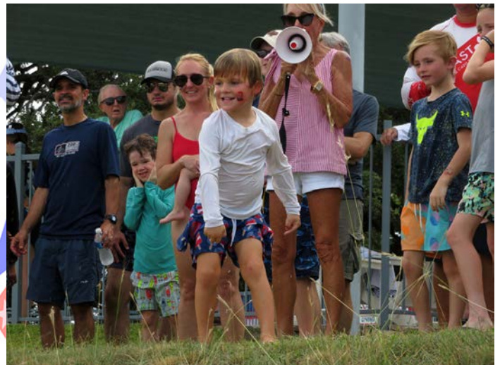
Driving Range Game