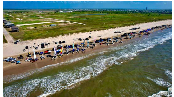
The Bolivar Big Run lineup