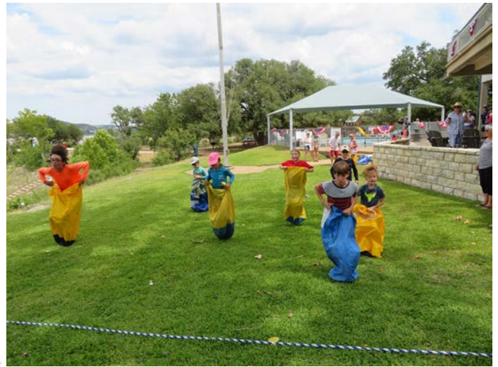
Kids' Sack Races