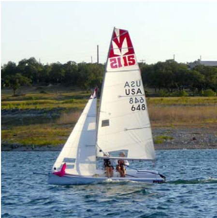
Sail 648 Melges 15