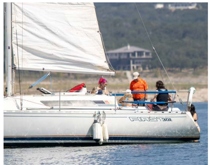
Beneteau First 30E Nemesis