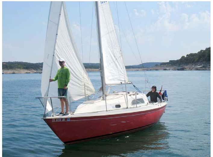
Dog Days 4 Pearson 26 Incognito