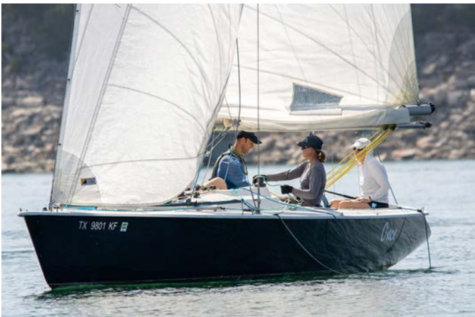
11 Meter Once