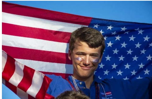
Supporting Austin's Competitive Sailors!

The AYC Fund supports competitive sailing in the Austin area. Our grants enhance sailing education, training and race management programs, assist junior and adult athletes in national and international competitions, and support an environment for hosting regional and national level events here at AYC.