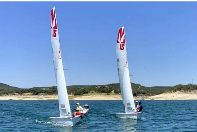
Melges 15s