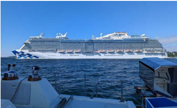
This is what the cruise ship looked like from my boat.

Coincidentally, I had a couple of women who own a boat on my dock and their 3 kids that wanted to go for a sail. I didn't actually tell them how far we were sailing.... But the wind was nice, and we sailed over to Seattle and got to the cruise terminal in time to watch the cruise ship depart. I wanted to get close enough to get the ship to blow her horn at me, but I couldn't quite get there. However, a J/130 passed me and was able to get the horn to blow. Evidently, they had friends on that ship as well, as we both sailed along side of the cruise ship for a while waving and such.