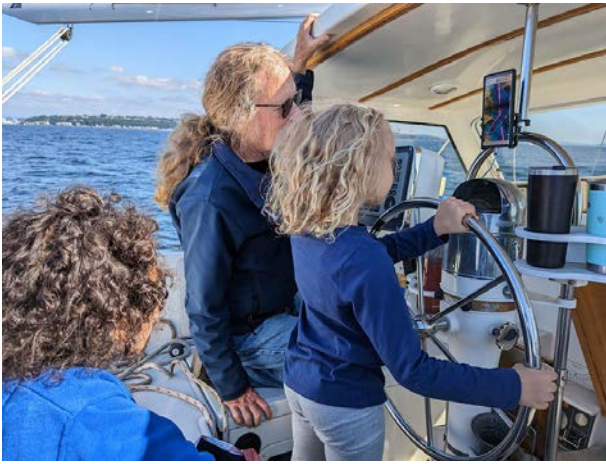
My crew to Seattle – both women and two of the kids sailed.

Coincidentally, I had a couple of women who own a boat on my dock and their 3 kids that wanted to go for a sail. I didn't actually tell them how far we were sailing.... But the wind was nice, and we sailed over to Seattle and got to the cruise terminal in time to watch the cruise ship depart. I wanted to get close enough to get the ship to blow her horn at me, but I couldn't quite get there. However, a J/130 passed me and was able to get the horn to blow. Evidently, they had friends on that ship as well, as we both sailed along side of the cruise ship for a while waving and such.