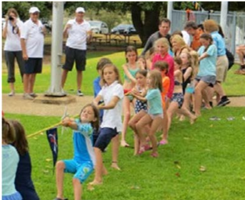
Competitions for ALL Ages!