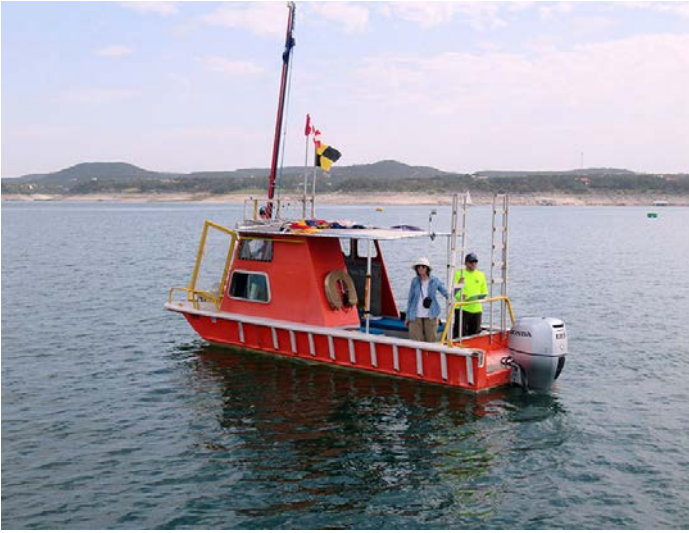
Dog Days 3: Cheryl Pervier and Dan McFerren on signal boat