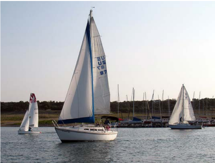
Melges 15 Lucky, Catalina 27 Better Than Chocolate, Pearson 26 Rusalka