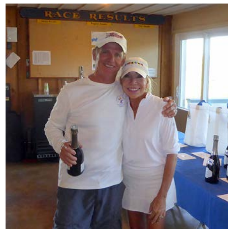
Sunfish 2nd Bay Peterson