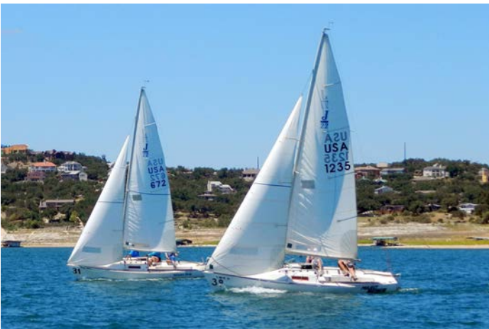
Dog Days 2: J22s Silicon Ship and Project Mayhem