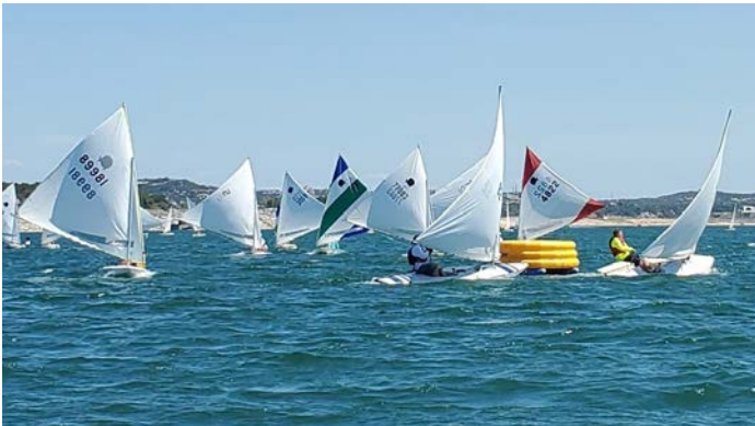
Sunfish racers