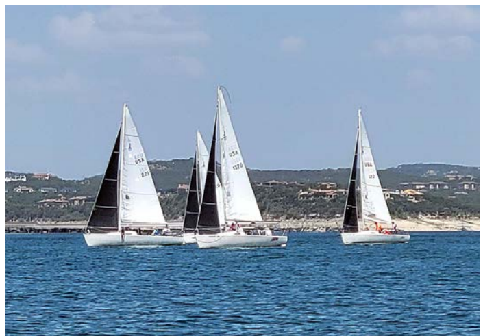
Dog Days 5 J80s Too Much J, Air Supply, Speed Racer, Jazz Tacks