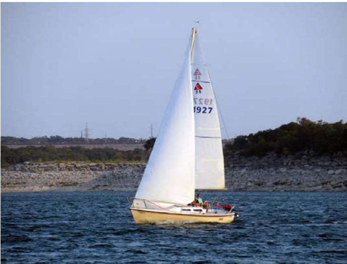
Capri 25 Orner