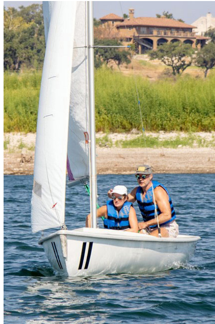
Love the determination in their eyes!!