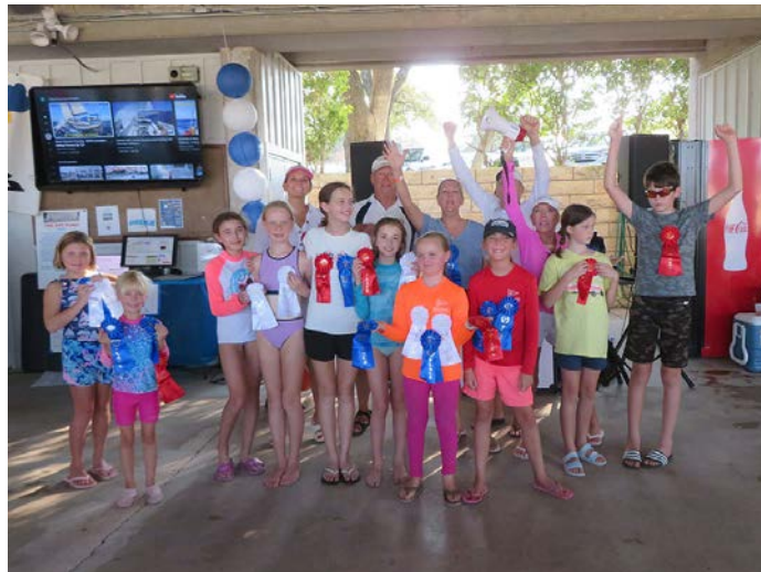
Family game winners