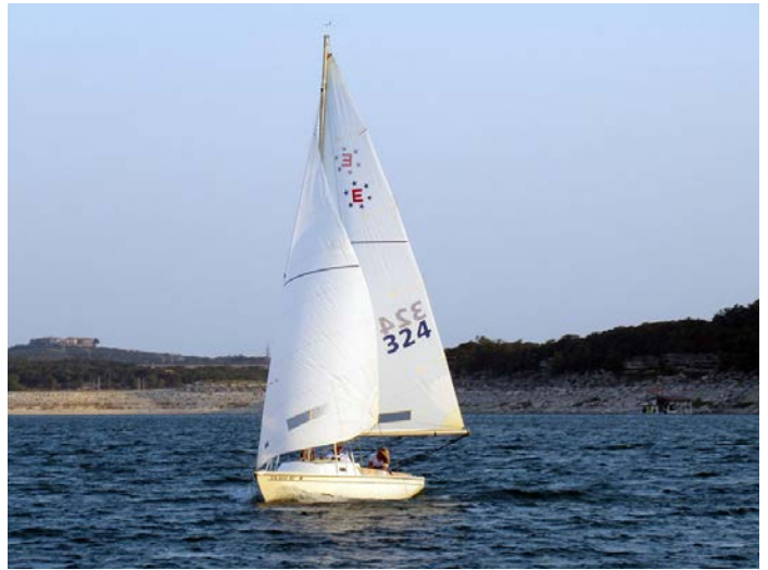
Ensign Jonathan Seagull