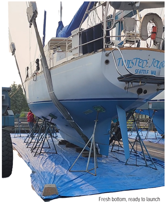
Fresh bottom, ready to launch

Nice and peaceful up here. For reference I'm sitting on a mooring at a state park that is only accessible by boat as I write this. ☺ (BTW, the guy that helped me bring the boat in to the lift pulled me aside later and told me how much he really loved my boat).