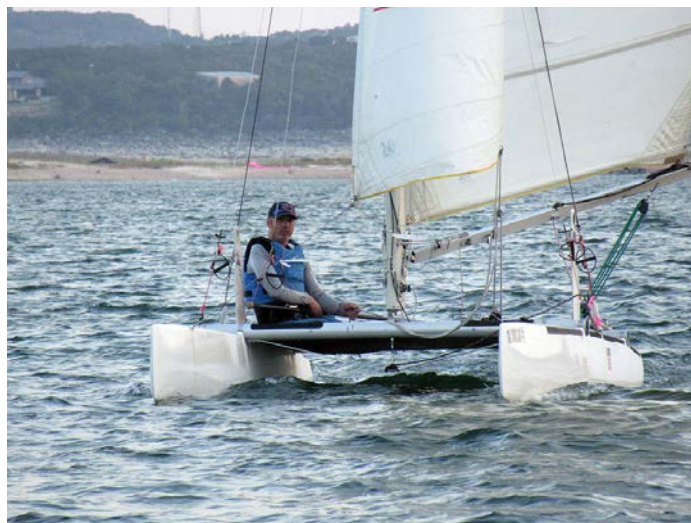
Catamaran Nacra 5.2