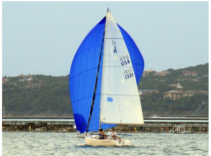
J80 Blood Sweat & Tears