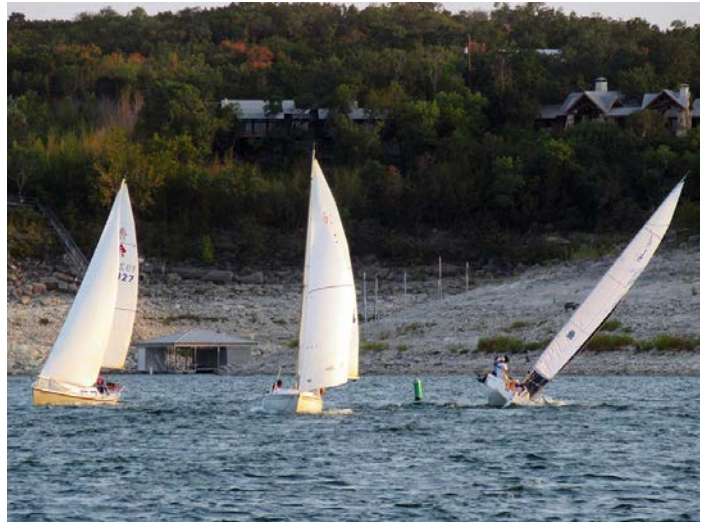
L-R: Capri 25 Ornerly, Ensign Jonathan Seagull, J80 Blood Sweat & Tears