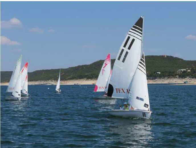
420 Fleet races