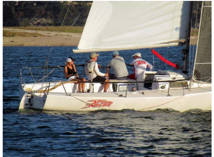
J80 Speed Racer