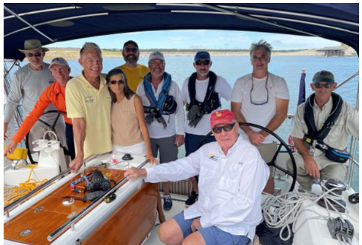
COB Drill Boat owners / skipper / crew