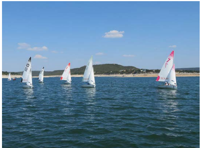
420 Fleet races