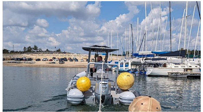
So, if at first you don't succeed, then try something else!