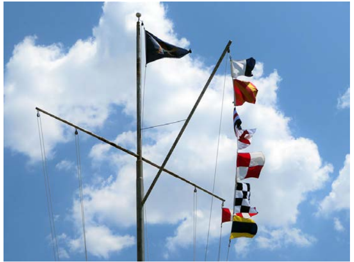
Event flags are up