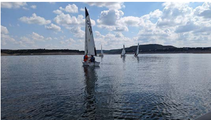
Some days were windy and some were rather light.