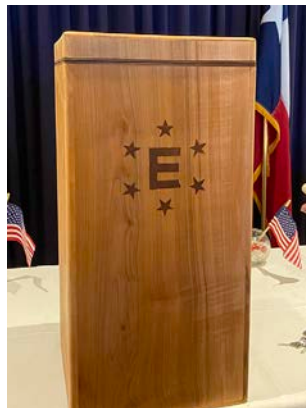
New trophy box for the Ensign Region IV Nazro Cup trophy, built by Tom Groll