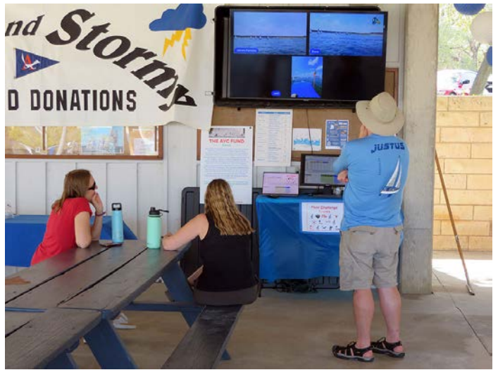
Watching the 420s on YouTube live