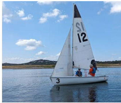
Working on moving and sail trim