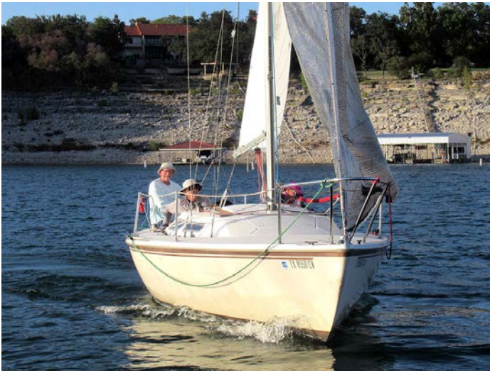
Capri 25 Ornerly