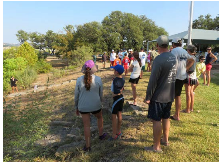
Egg toss spectators