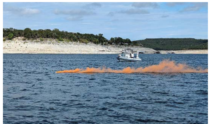
Guess it thought it was going to a UT game?