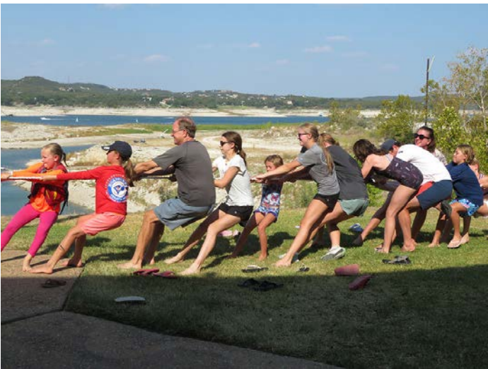
Tug of war