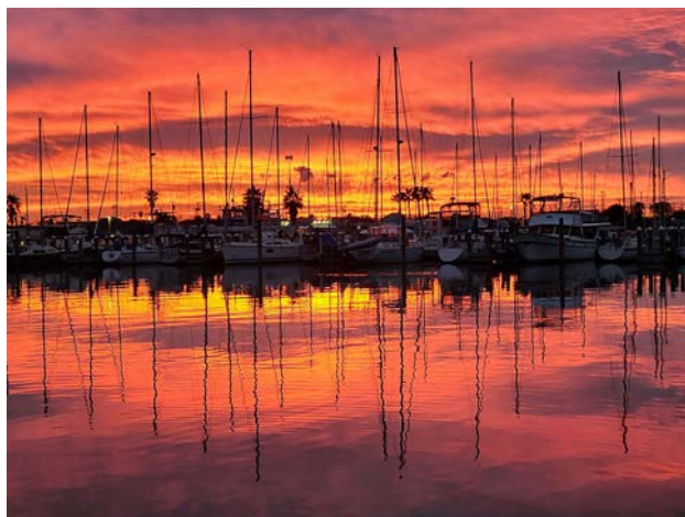
A winter sunset visit to the Rockport Yacht Club

As we approach the close of the year, our Junior Sailing program is not just a story of accomplishments but also one of growth and anticipation for the challenges that lie ahead. We extend our heartfelt wishes to all our young sailors for continued success, a Merry Christmas and a Happy New Year with family and loved ones.