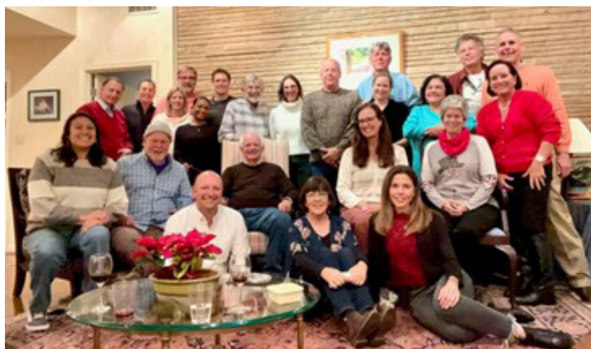
Ensign Fleet Holiday Party