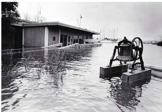
Next time you walk past the bell... (from the 1991 flood)