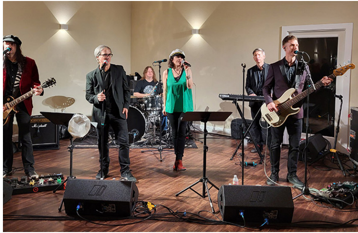
High Fidelity band provides great entertainment and high energy on the dance floor