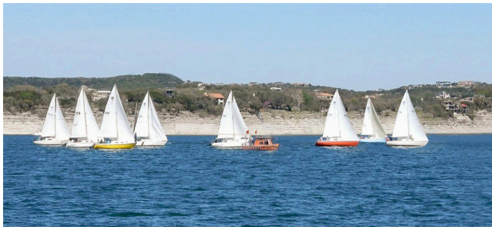
Pearson 26 Fleet

Next up will be the Red Eye Regatta on Jan.1st. I hope that we have a good turnout. We should have TV service in the clubhouse, so we can watch the bowl games after the race.