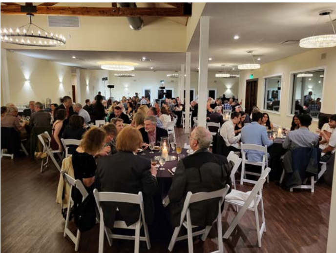
Enjoying drinks, dinner and camaraderie