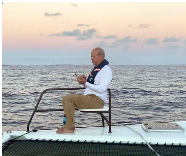
El Commodore explores Blue Water sailing to the Bahamas in November