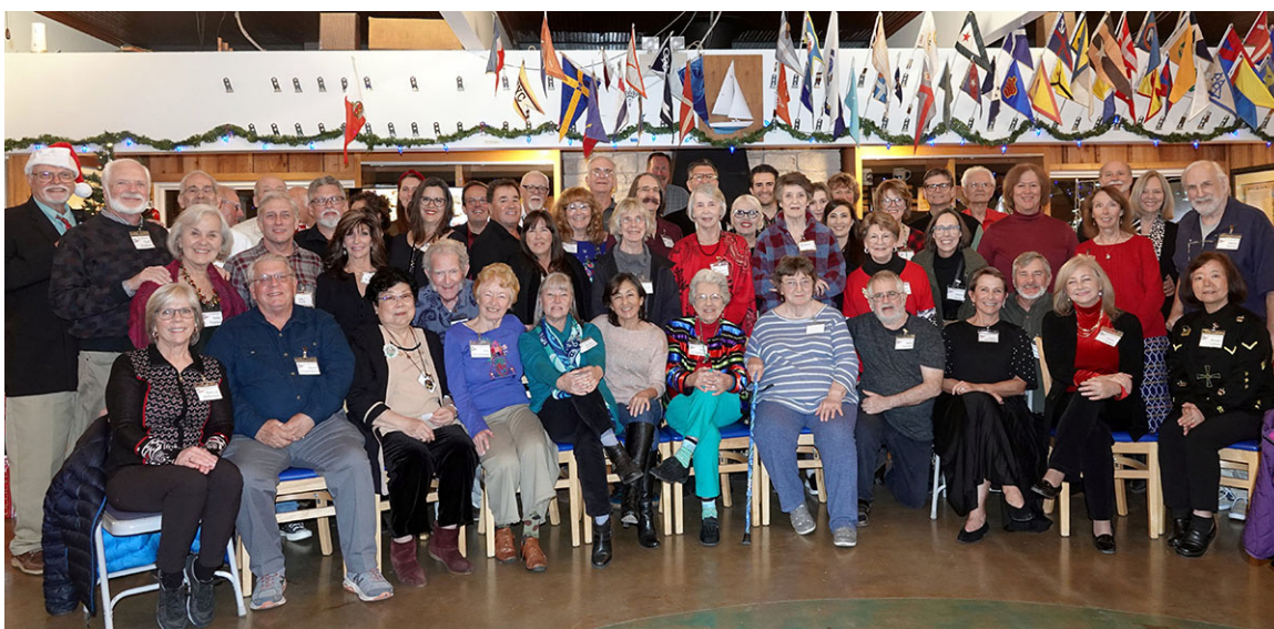
Fleet 69, our local All-Catalina Cruising Fleet, well represented at the fleet holiday party.