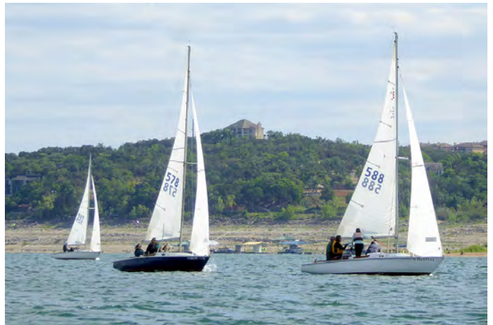
Ensigns L-R: Dos Locos, Dancing Bear, Stijf Kop