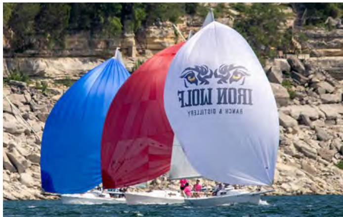
Close crossings were common.