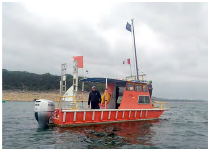
Thank you, Race Committee!