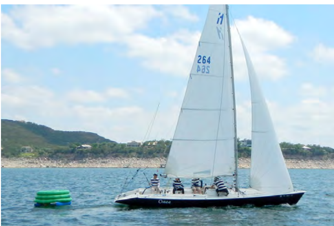
11 Meter Once