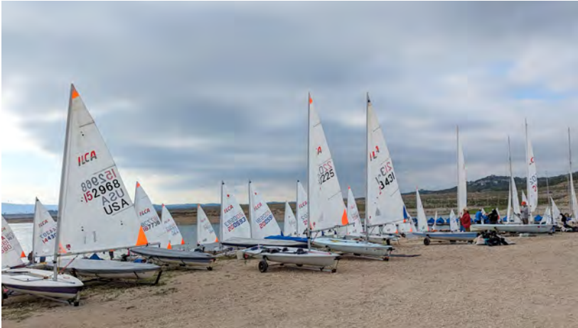
Staging area for Lasers waiting for wind