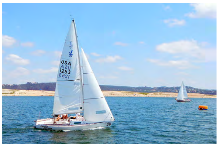
J22 Project Mayhem