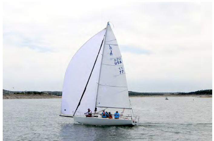
J80 Warp Speed