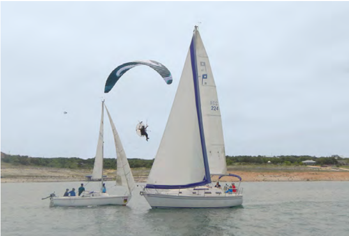
Paraglider watching Catalina 22 Rajin Cajin and Pearson 31 Aphaia