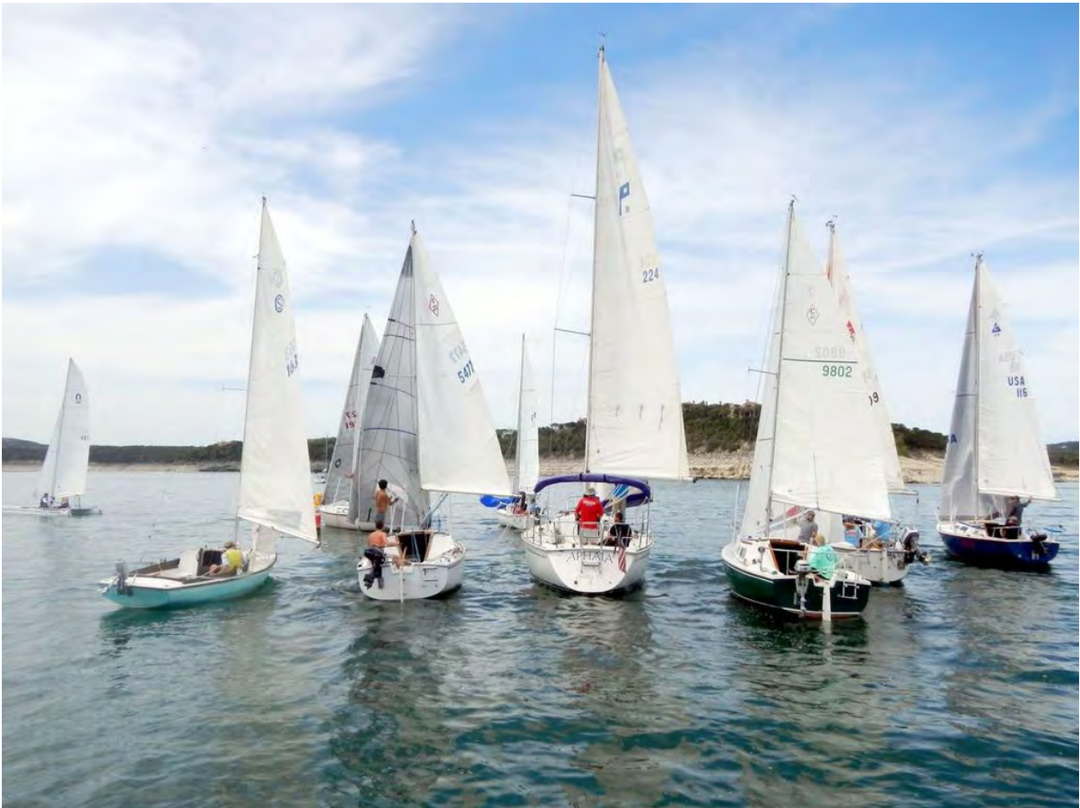
Spring Series Race #3, Calling for room at B Mark, L-R: Nacra Old Skull, Southcoast 21 WT, Capri 25 Ornerly, Catalina 22 Moonlight Sonata, Capri 22 Gunes, Pearson 31 Aphaia, Catalina 22 Chile Verde, Catalina 25 Winging It, Capri 25 Kami