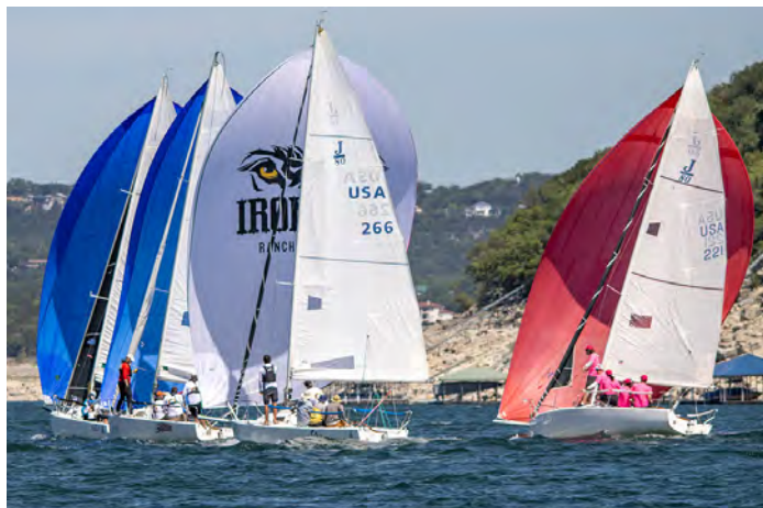
Approaching the leeward mark