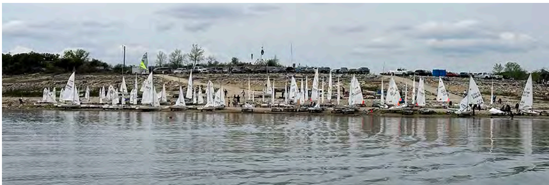
Roadrunner participants launching