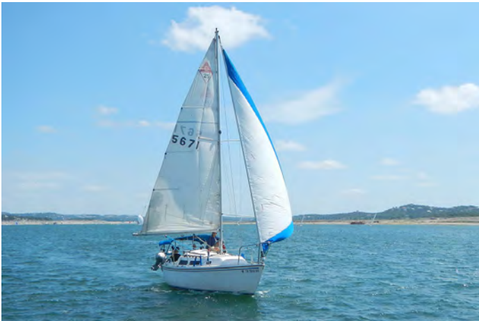
Catalina 25 Waturi