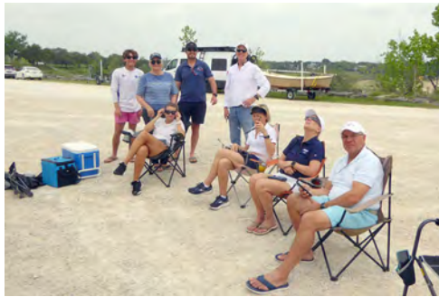
North U participants took time to watch the eclipse