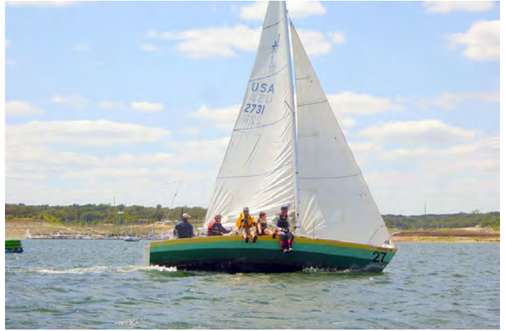
J24 Out of Control