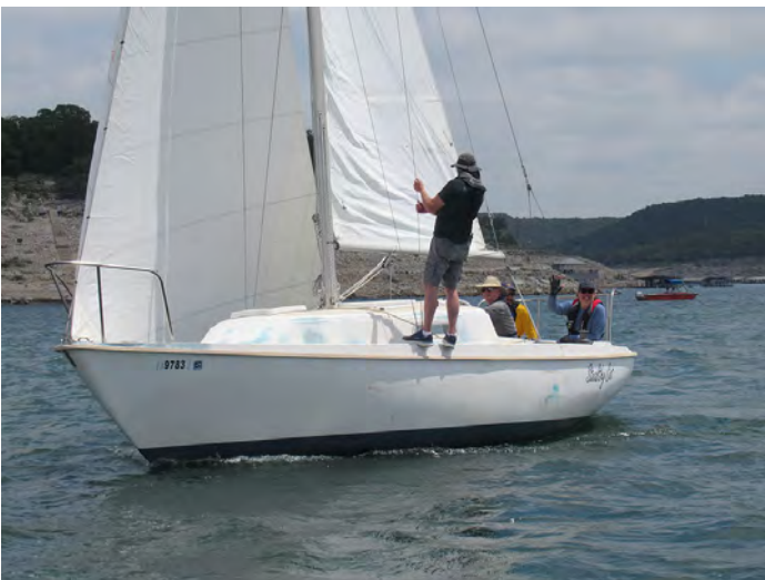
Pearson 26 Stealthy Cat