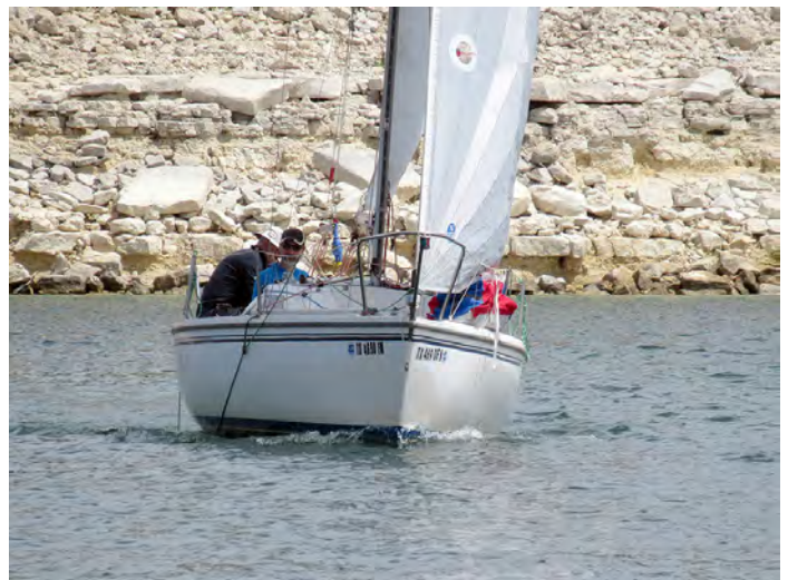
Capri 22 Gunes