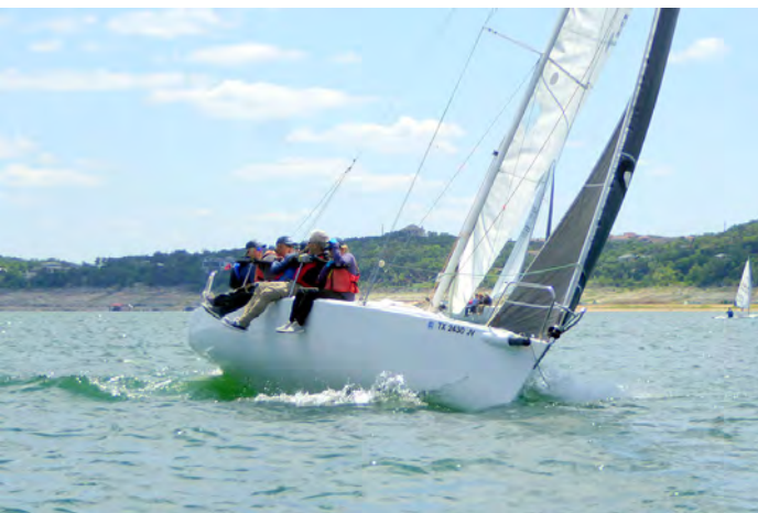
J80 Sweet T