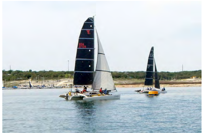
Corsair F27 Trinity and Corsair Sprint 750R Lucy Gene