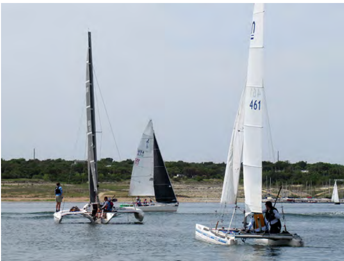
L-R Corsair Spring 750R Lucy Gene, J80 JazzTacks, Nacra 5.7 Old Skull