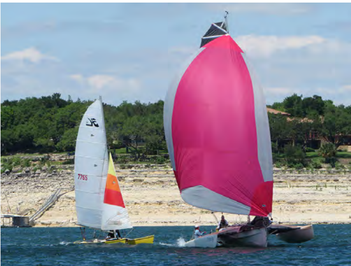
Catamaran Hobie 18 and Trimaran Trinity