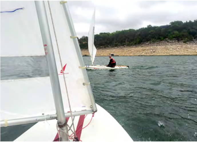
View from a Sunfish