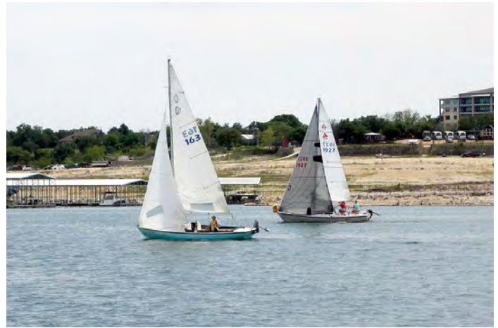
South Coast 21 WT and Capri 25 Ornery