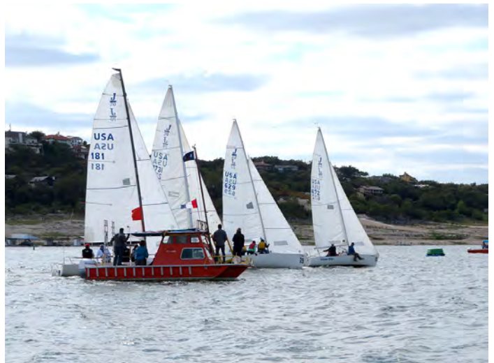
J70-J24-J22 start, L-R: J70 GB, J24 Out of Control, J22 Bonfire, J22 Silicon Ship