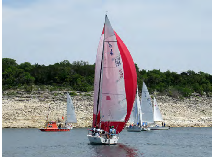
L-R J80s JazzTacks, Air Supply, Warp Speed, Rajin Cajin