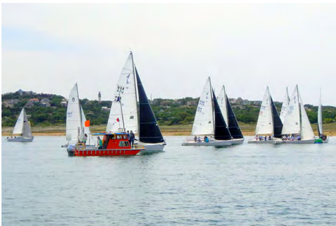
J80 start, Pearson 26 was Race Committee