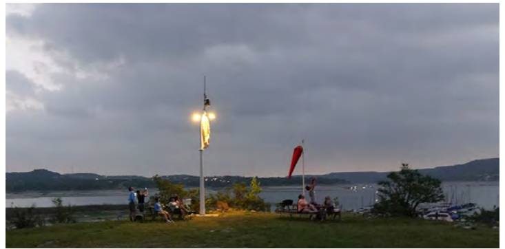
Solar Eclipse Totality on the AYC Point