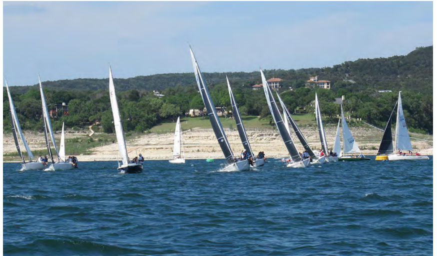
J80s and Ensigns going upwind