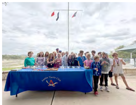
Awards table, Green Fleet