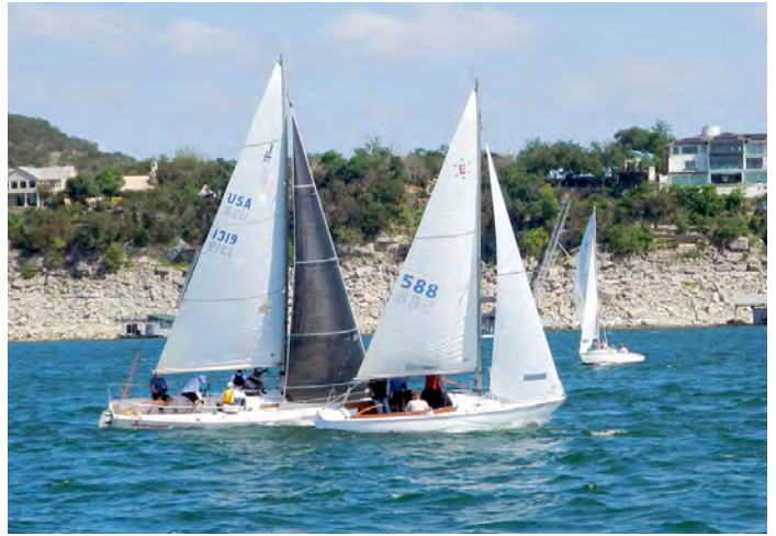
J80 Jackrabbit vs Ensign Stijf Kop