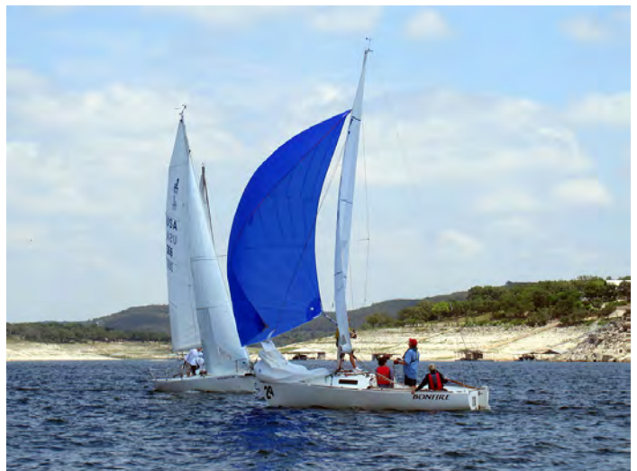
J80 Theseus and J22 Bonfire