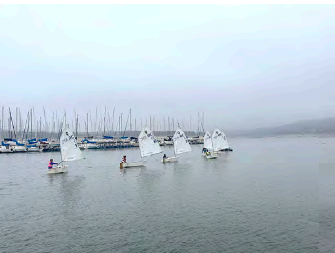
Optis being towed to practice by Zach