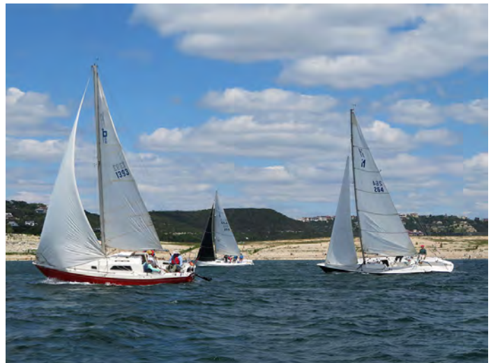
L-R: Pearson 26 Incognito, J80 Flyer, 11 Meter Once