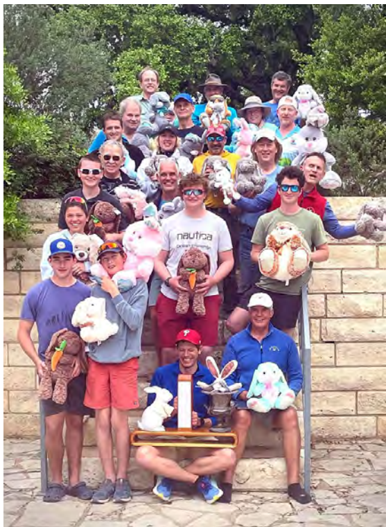
Everyone's a Winner!