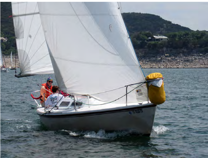
Capri 25 Ornerly