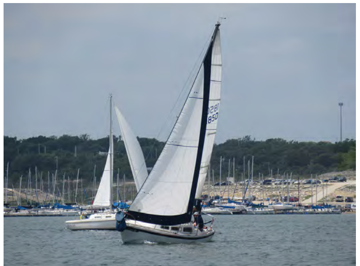
Pearson 26 Rusalka and Catalina 27 Nancy 'O'