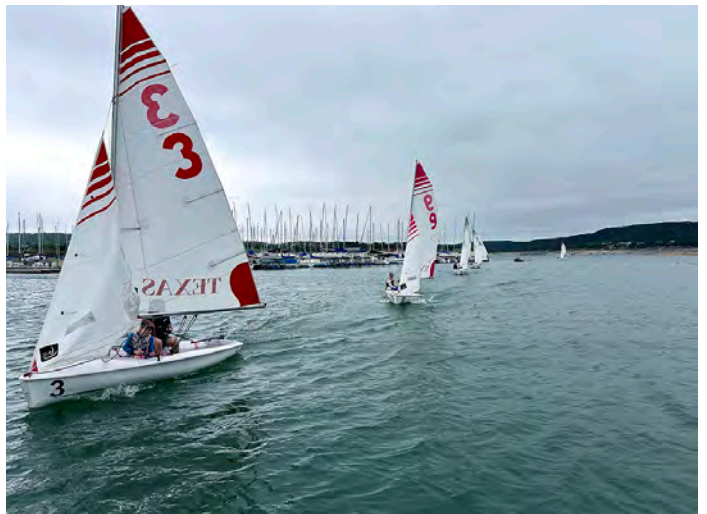
Middle School Class coming to dock after practice