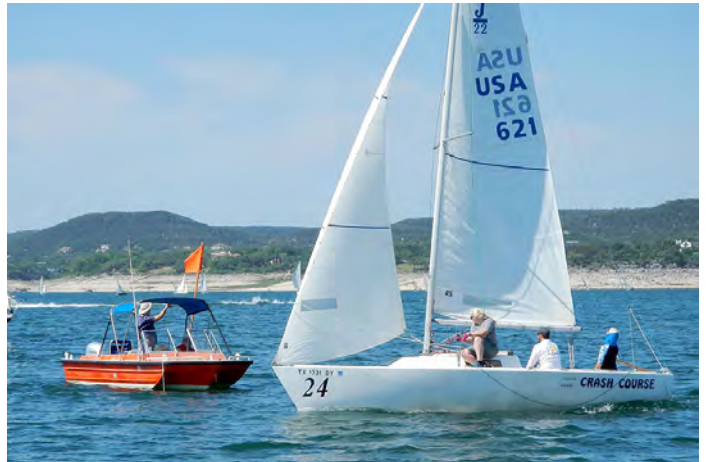
J22 Crash Course