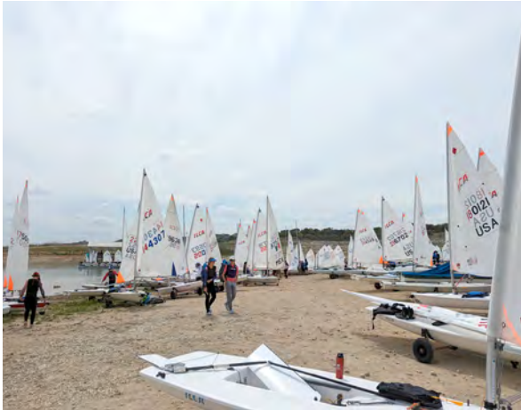
Staging area for Lasers