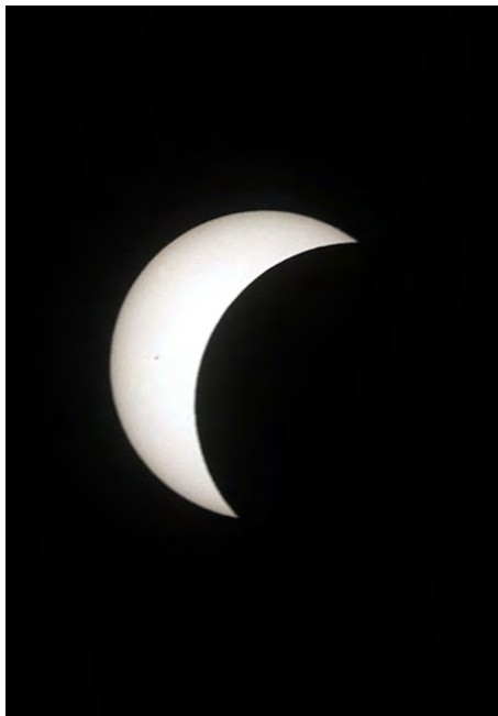
The Total Eclipse, part one