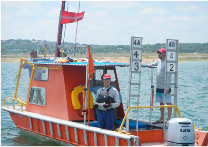
Multihull Fleet ran Race Committee