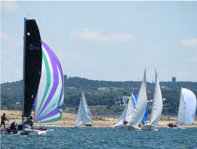
L-R: Trimaran, Ensign, J22, Pearson 26, Pearson 26, J80