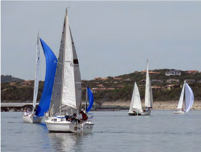
L-R J80 Speed Racer, Catalina 22s Elysium and Chili Verde, Catalina 30 Rendezvous, J80 Warp Speed