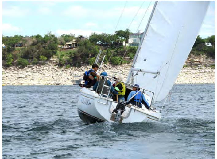
Pearson 26 Rusalka