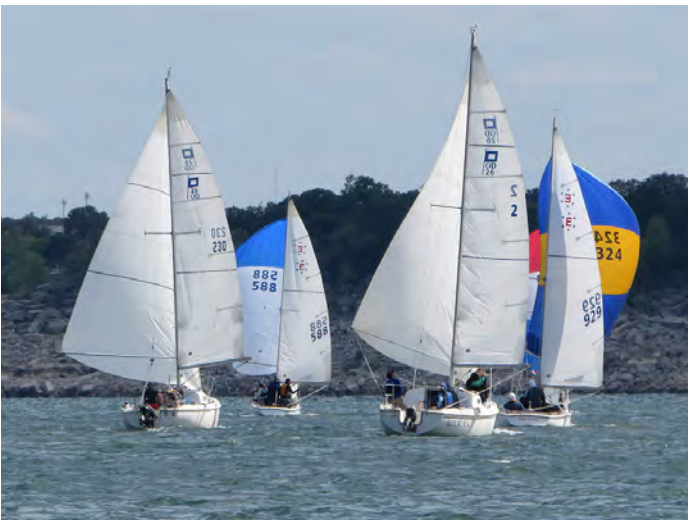
L-R: Pearson 26 Jack of Hearts, Ensign Stijf Kop, Pearson 26 Rusalka, Ensign Dos Locos