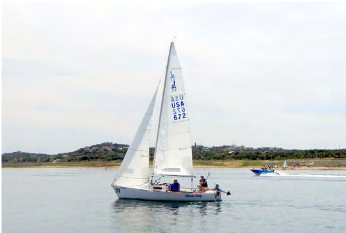
J22 Silicon Ship