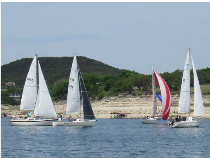
L-R Catalina 27 Nancy 'O, J80s Restless and JazzTacks, Pearson 26 Stealthy Cat