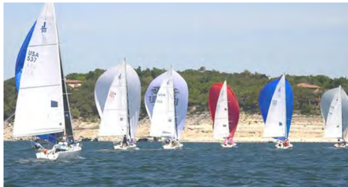
J 80s on a close downwind leg