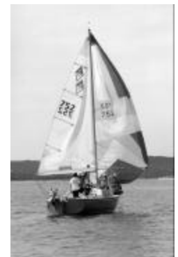
Wade Bingaman on Dry Heave ala chute.