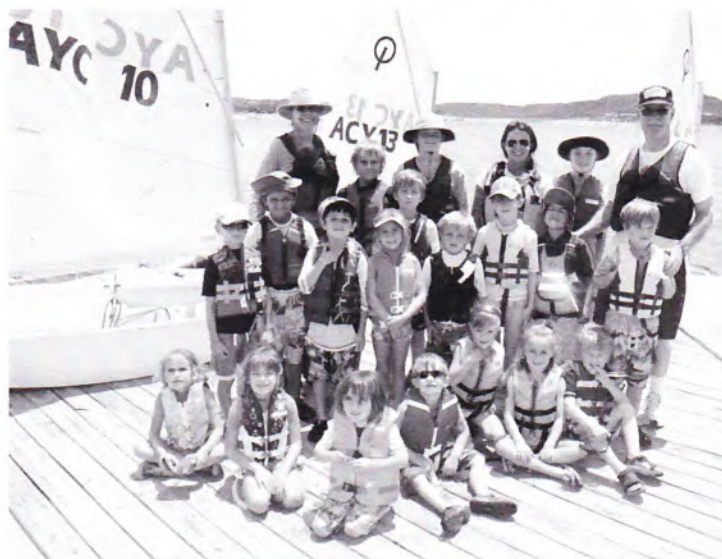
SUMMERTIME CAMPS FUN FOR KIDS AND COUNSELORS!