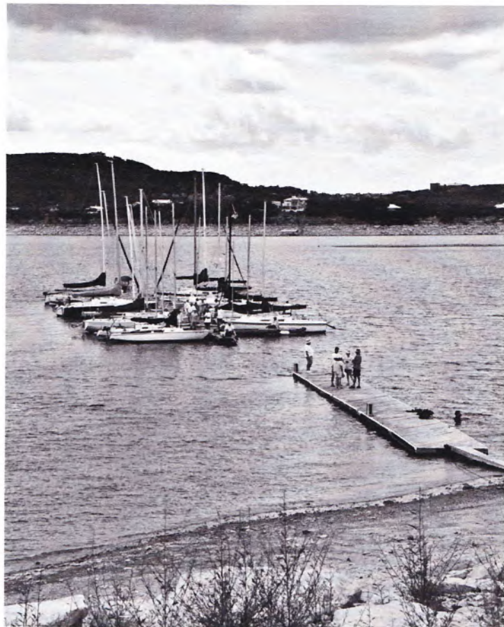
DOCK 1 AND KELLER POINT CONSTRUCTION