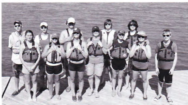
AYC 2011 Camp Staff