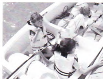
Twins go sailing