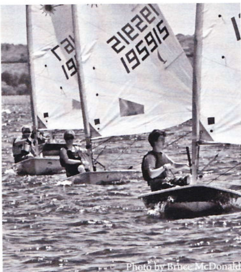
Easter Laser Regatta

The Easter Laser Regatta was held for two days in what could only be called survival conditions, followed the next weekend with the South Coast 21 National Championship in everything from high wind conditions to no wind. By the first weekend in May, we had perfect wind and water conditions for the