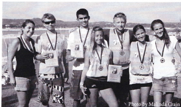
2011 ISSA 1st Place - Antilles