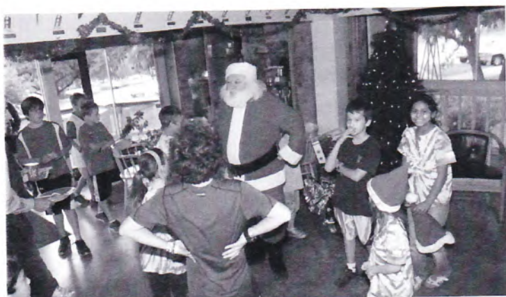
Santa and Roadrunners