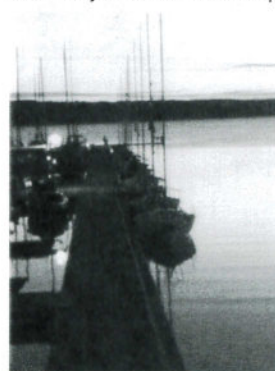
J/24s at Lake Canyon Yacht Club rigging dock at sunset

In addition to the Frostbite Series races, we are planning a caravan of "circuit" boats to have fun at Lake Canyon Yacht Club (LCYC). Likely boats from AYC are: Superman, Ooh Ahh, Free Spirit, and Thunder Cookie. Hopefully, ayeBoat will be finished and will be able to join the fun! We plan to use this opportunity to tune the