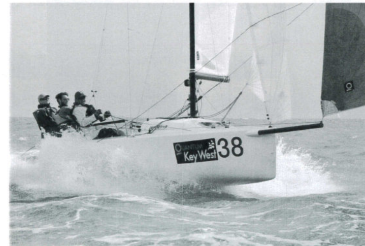
Our finest moment.

The J/70 is a fantastic boat which is extremely sensitive to tuning and sail trim. It rewards good drivers and punishes bad ones. If the rig tuning or sail trim is off, you are toast. The regatta was a huge learning experience and we are back in Austin trying to figure it all out. The location was a great spot for a January regatta and the parties were fun and a great way to get to know the sailors in the new fleet. And, oh, we did NOT finish last.