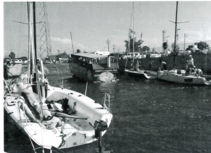
Key West Duck Tour muscles down the ramp.

A few things about Key West and the J/70 staging area. We really had no time for sightseeing other than travel between the hotel and launch site. In fact, due to our late arrival at the launch site each evening, we usually had to go to the debriefings in our wet sailing gear. Key West is a beautiful island with many period buildings which has become overrun with tourists, giving it a bit of an adult Disneyland feel. The locals can be recognized by their close resemblance to extras from the "Walking Dead." The heavy police presence coupled with the tropical climate gives it a banana republic feel. The launch site was at the Truman Annex, a military site. We had a parking lot for 38 J/70s plus a few Melges. There was a large ramp with room for one boat on each side to drop keel, place rudder and get the sails up. Lest we forget that we were in Key West, we had Key West Duck Tours sharing the ramp with us and about every 15-20 minutes one of the behemoths would muscle their way down the ramp.