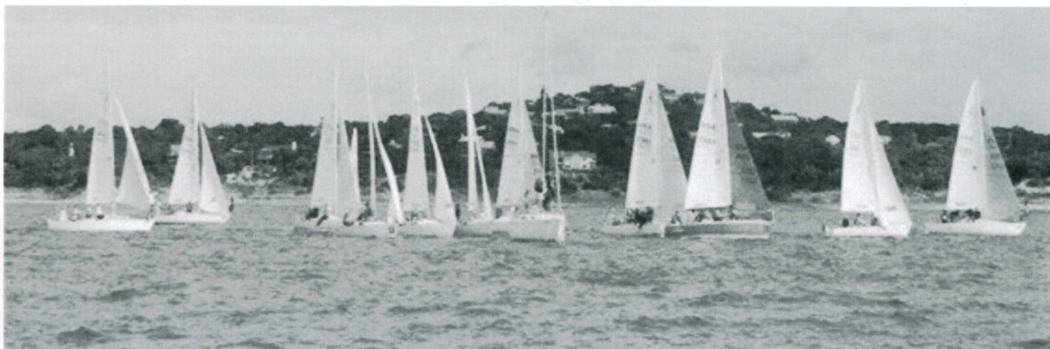
J/24s at Lake Canyon Yacht Club Wurstfest Regatta 2012