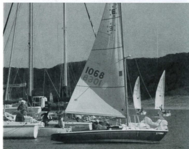
Randolph Bertin and crew - Ensign